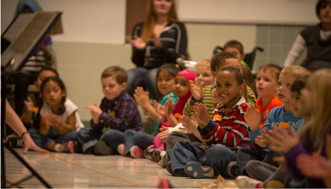
Students at Oak Grove Elementary School in Bloomington enjoyed a performance by The Mirandola Ensemble as part of Classical MPR's Artists-in-Residence program.