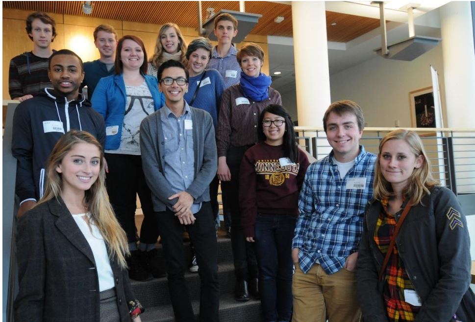
Local Current Blog student writers from across Minnesota gathered at MPR in April and October for one-day training sessions in music journalism.

Through the College Contributors program, the Local Current Blog features the writing and photography of students from across Minnesota. Students build their journalism skills by working with Local Current Blog editors and attending a day of training in music journalism at MPR. Their contributions offer audiences across Minnesota new perspectives on local music, covering campus music news, live events and music scenes from Winona to Duluth to Moorhead. In 2014, more than 190 Local Current Blog posts featured work by 29 student writers and three student photographers, representing a total of 14 different colleges in nine different Minnesota cities.