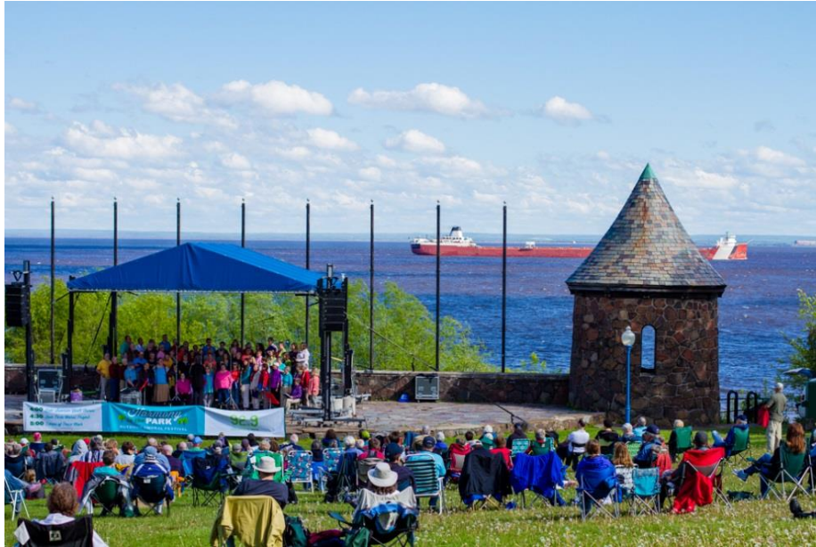
Harmony in the Park was held at Leif Erikson Park in Duluth.

Harmony in the Park is a family-friendly outdoor choral festival series. Free and open to the public, three Harmony in the Park events in 2014 convened some of the state's finest choral ensembles to fill summer evenings with song. In total, 2014 Harmony in the Park events had more than 3,000 attendees and featured nine Minnesota choral ensembles including more than 340 individual singers.