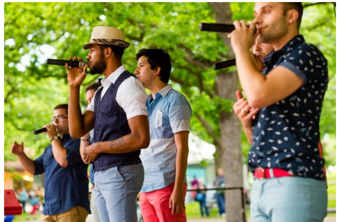
A cappella group Six Appeal performed at Minnehaha Park in Minneapolis.