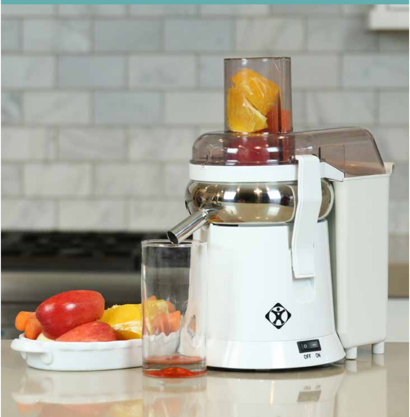
L'EQUIP®Dehydrators, Blenders & Juicers 2017