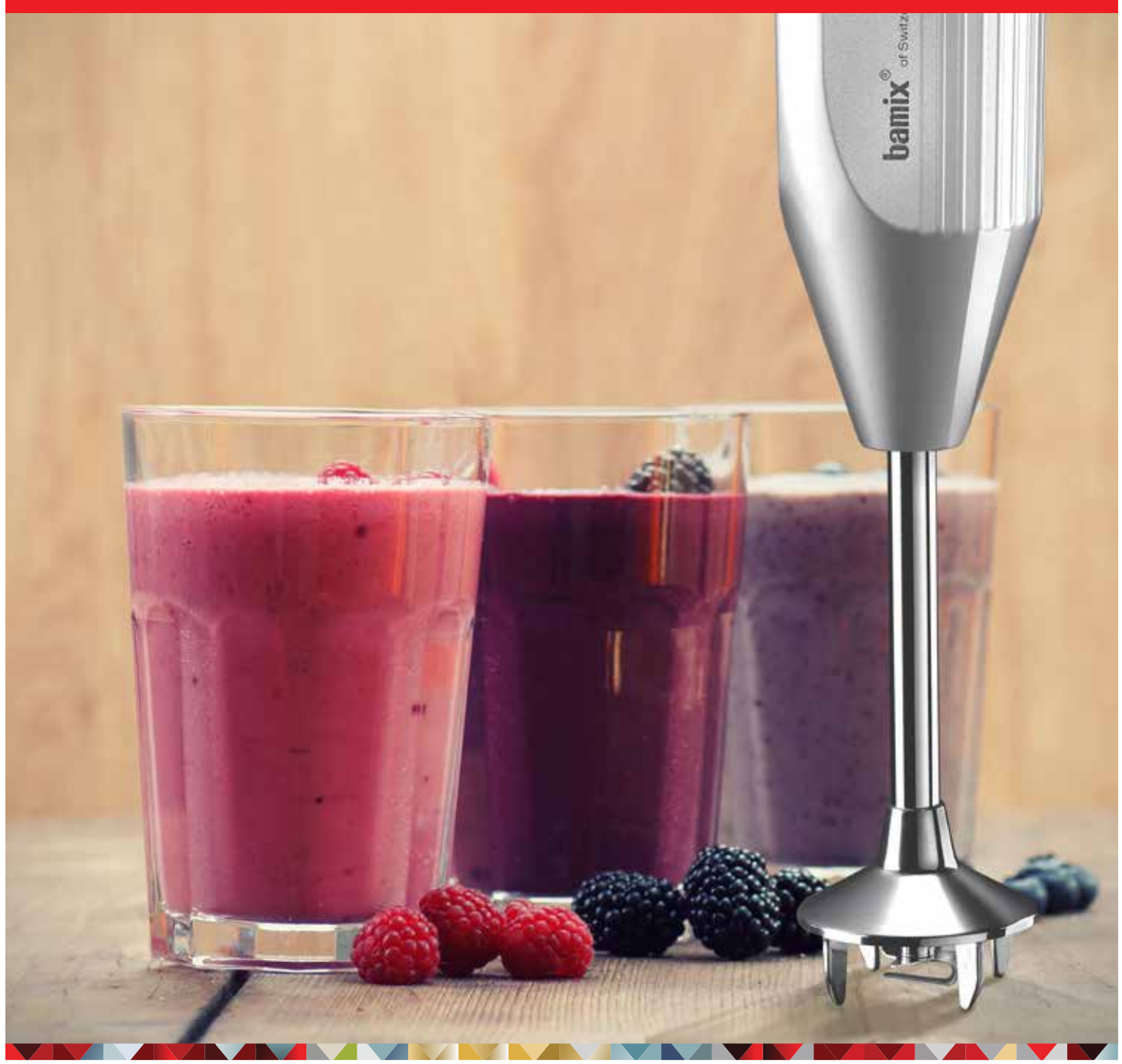
bamix® Immersion Blenders 2016