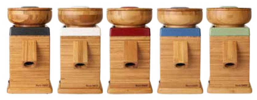
Charcoal - Powdered Sugar - Cayenne - Blue Moon - Edamame