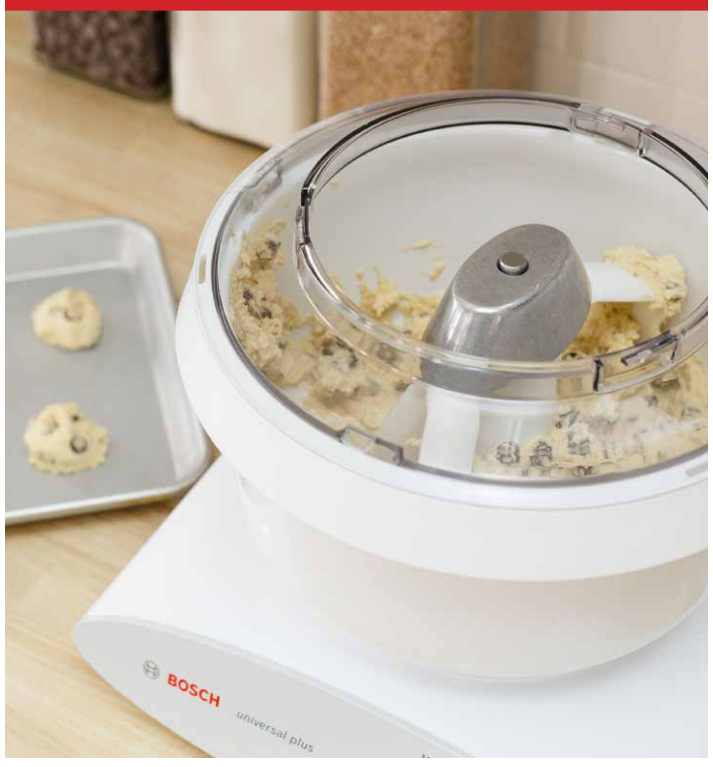
BOSCH® Kitchen Machines 2017