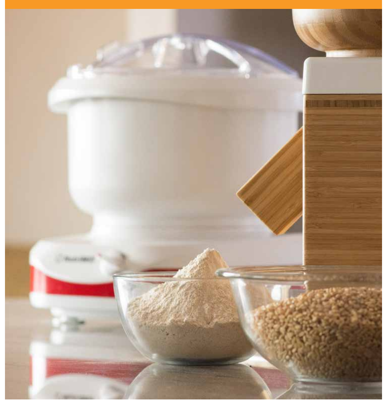
NutriMill® Home Grain Mills and Mixers