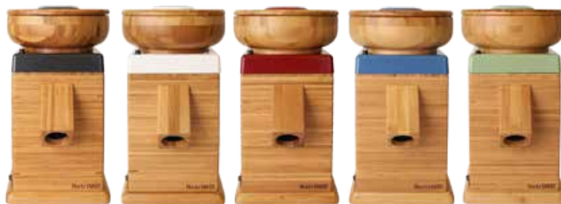
Charcoal - Powdered Sugar - Cayenne - Blue Moon - Edamame