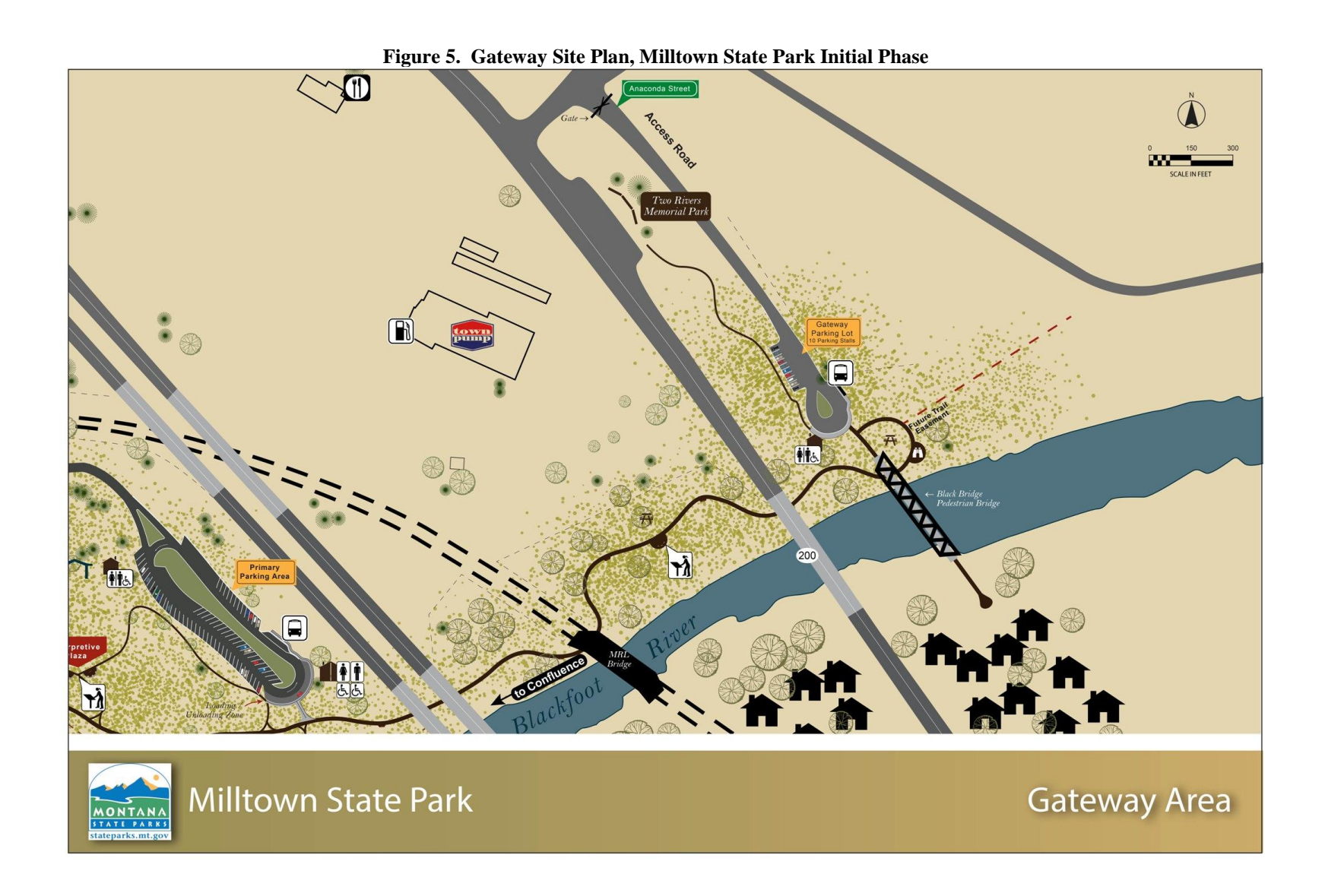
Milltown State Park Draft Environmental Assessment and Review ~ January 2014 ~ P. 10