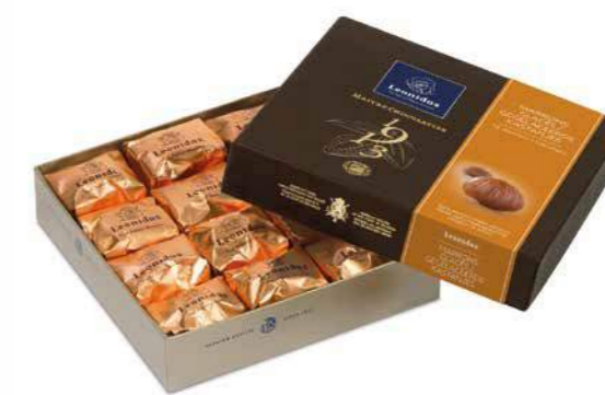
Boxes of candied chestnuts

This box contains 12 good reasons to treat yourself with these candied chestnuts made with natural products, no additives or preservatives. Authenticity in its purest state.