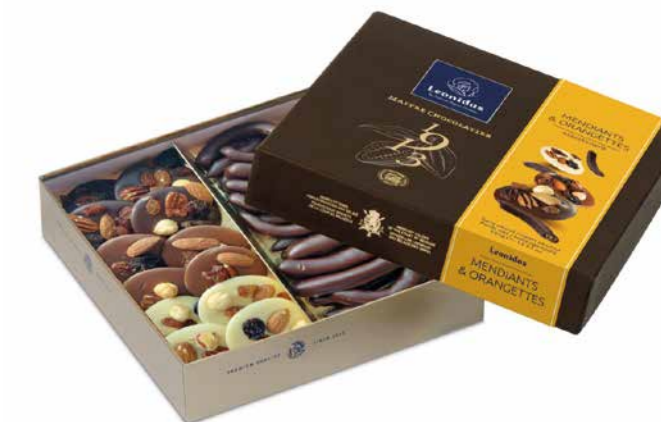
Boxes of Mendiants & Orangettes

With this box of Mendiants and Orangettes, you can offer the best of both worlds: delicious candied orange peel coated with dark chocolate and dark, milk or white chocolate disks sprinkled with dried fruit.