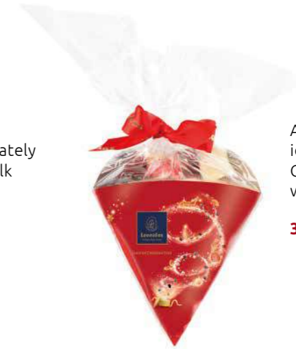
Cones filled with chocolates

An original and tasty idea: give a gift of a Christmas cone filled with chocolates!