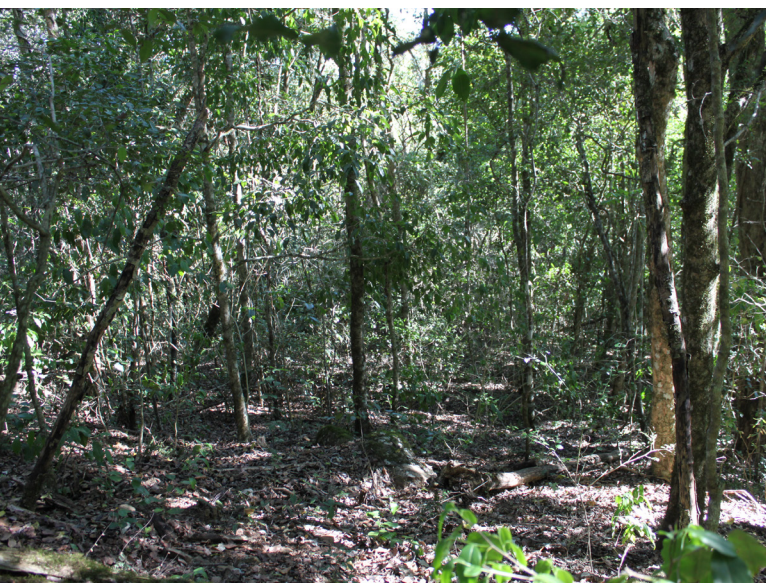
RE 12.9-10.16 contains plants with both microphyll (small) and notophyll (medium-sized) leaves. This photo shows the dappled light that is formed on the canopy floor of vine forests, even if there are no mature Hoop Pines present (due to past logging activities).