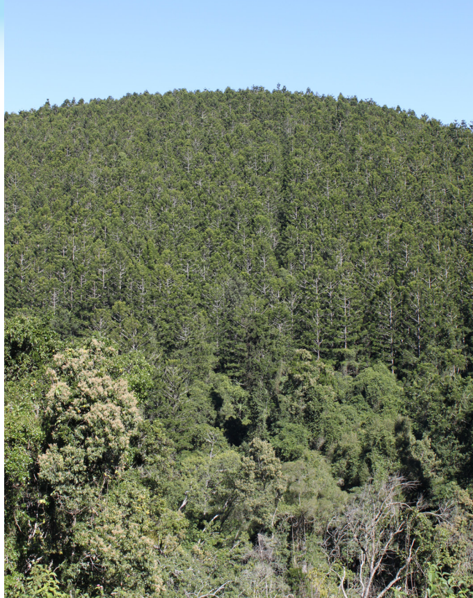
Much of the original extent of RE 12.9-10.16 has been cleared and replaced with Hoop Pine plantations (shown here in the background).

Early plantings used maize and papaws in the initial stages to provide shelter for the Hoop Pine seedlings and to reduce the growth of weeds. The fertile soils supporting Hoop Pine vine forests were also cleared for dairying and fruit growing. However, many patches survived on lands set aside as state forest and on slopes that were too steep or rocky to clear.