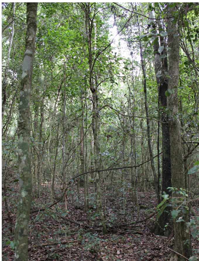
Mature Hoop Pines and other trees harvested for timber are still absent or uncommon in patches of RE 12.9-10.16 many years after logging. During early logging operations much of the low scrub vegetation was retained, and the shade and competition reduced the ability of some trees, such as Hoop Pine, to regenerate.