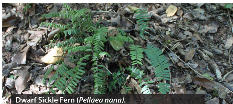
Dwarf Sickle Fern ( Pellaea nana ).

Designed and produced by Healthy Land & Water, a community based, not-for-profit organisation that works to protect and restore the natural resources of South East Queensland. Visit www.hlw.org.au