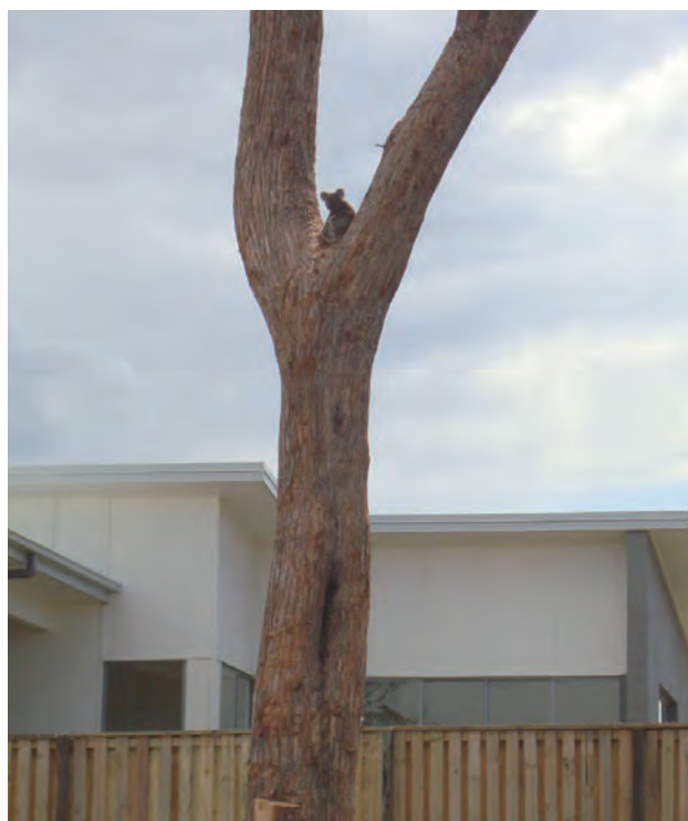
Urban encroachment is a major contributor to habitat loss and threatens Koala survival in South East Queensland.

Land for Wildlife is a voluntary program that encourages and assists landholders to provide habitat for wildlife on their properties. For more information about Land for Wildlife South East Queensland, or to download Land for Wildlife Notes free of charge, visit www.lfwseq.com.au