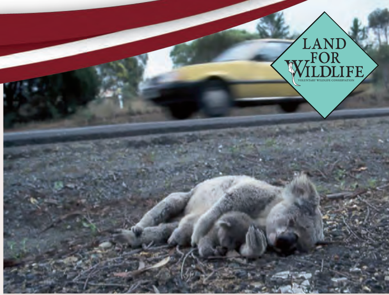
Many Koalas die on Queensland roads each year.