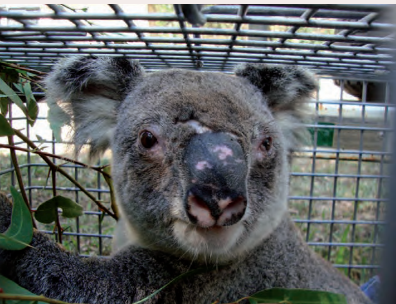
Red, swollen, infected or crusty eyes or fur loss around eyes, face or body are all signs of a sick Koala.