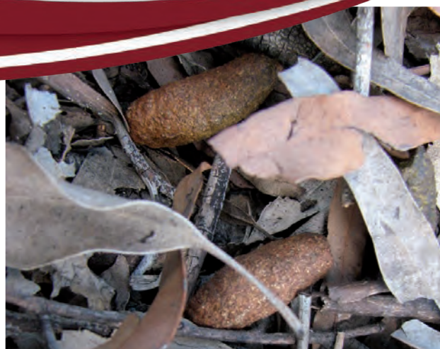
Koala scats have a distinctive shape and smell strongly of eucalyptus if broken.

www.thekoala.com/koala (excellent reference with information compiled from a number of sources).