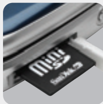
MiniSD External Memory Port MiniSD card sold separately