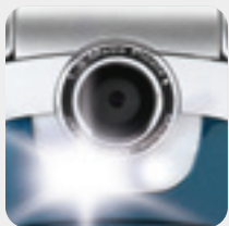
1.3 Megapixel Camera with Flash