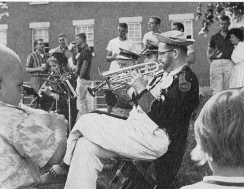
MUSIC: Clown Band entertained at The Tent to the delight to two members of the Class of 197? On Saturday night the music went from the ridiculous to the sublime with concert by the All-University Symphony Orchestra.