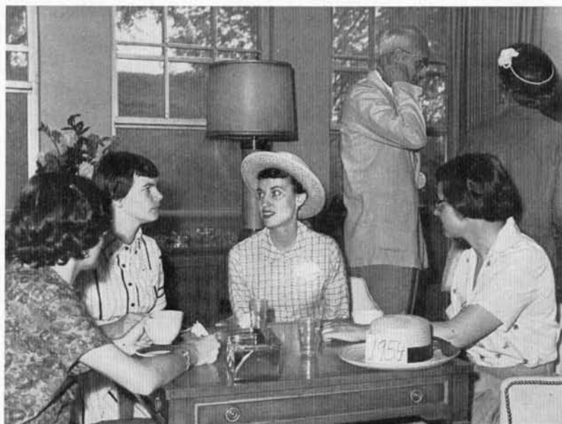
FASHION NOTE: Red-banded straw sailors identified the class of '54 at alumni events. Black derby hats were sported by the men of '44.