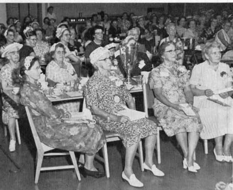
CLASS OF '09: On the golden anniversary of their graduation, the ladies of '09 win the Cutler Cup for attendance.