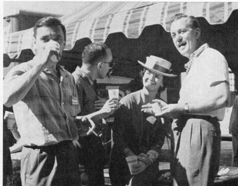
THE TENT: A large crowd gathered to refresh old friendships and make new ones . . . and to sip the usual refreshments served after the baseball game.