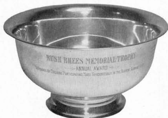
The Rush Rhees Memorial Trophy, awarded annually to the school or college participating most successfully in the Alumni Campaign of the University of Rochester Fund. This year the cup was awarded to the Eastman School of Music.