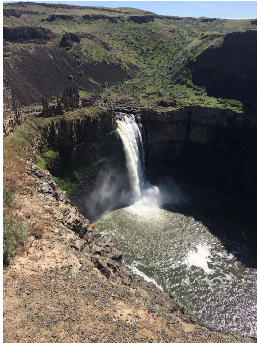
Palouse Falls State Park

This region has temperate and subtropical grasslands, savannas , and shrub lands.