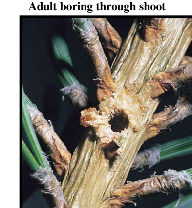
Entrance hole of adult in shoot

Closely inspect and monitor all nursery stock and Christmas trees received from quarantine areas and ensure shipments are accompanied by a federal certificate or stamp demonstrating quarantine compliance.