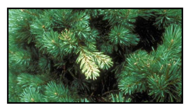
Damage caused by adult feeding

stain fungi has been associated with larval feeding in logs.