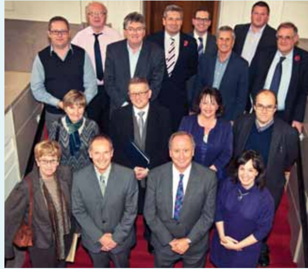
Aelodau Fesyllgor Ymgynghorol yr Archif Wleidyddol Gymreig Members of the Welsh Political Archive Consultative Committee