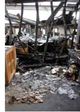
Difrod y tân / Fire damage