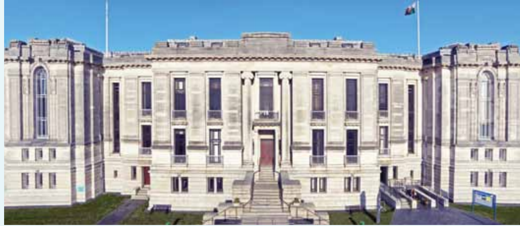
Llyfrgell Genedlaethol Cymru / The National Library of Wales