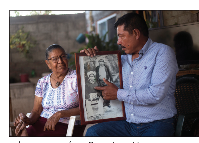
above: a scene from Guanajuato Norte