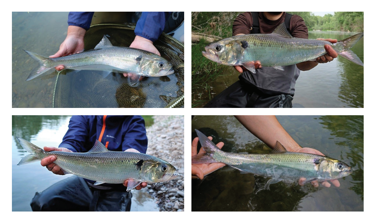
Figure 2. Adult specimens of twaite shad ( Alosa fallax ) captured by angling in the River Fluvià on May, 2015. Ejemplares adultos de saboga (Alosa fallax) pescados con caña en el río Fluvià en mayo de 2015.

other diagnostic morphological characters allowed us to identify the shad individuals captured in the Fluvià and Ter rivers as twaite shad. However, hybridization between twaite shad and allis shad has been reported over most of their historical range (Alexandrino et al., 2006; Coscia et al., 2010; Jolly et al., 2012), including the Western Mediterranean (Rhône and Ebro rivers) (Andree et al., 2011; Faria et al., 2012; Sotelo et al., 2014). For example, 34 % of individuals collected in a study in the Ebro presented typical allis shad mitochondrial haplotypes despite being morphologically classified as twaite shad (Sotelo et al., 2014). Therefore, without genetic analysis, the possibility that some fish from the Fluvià are hybrid individuals is feasible and should be clarified in subsequent studies.