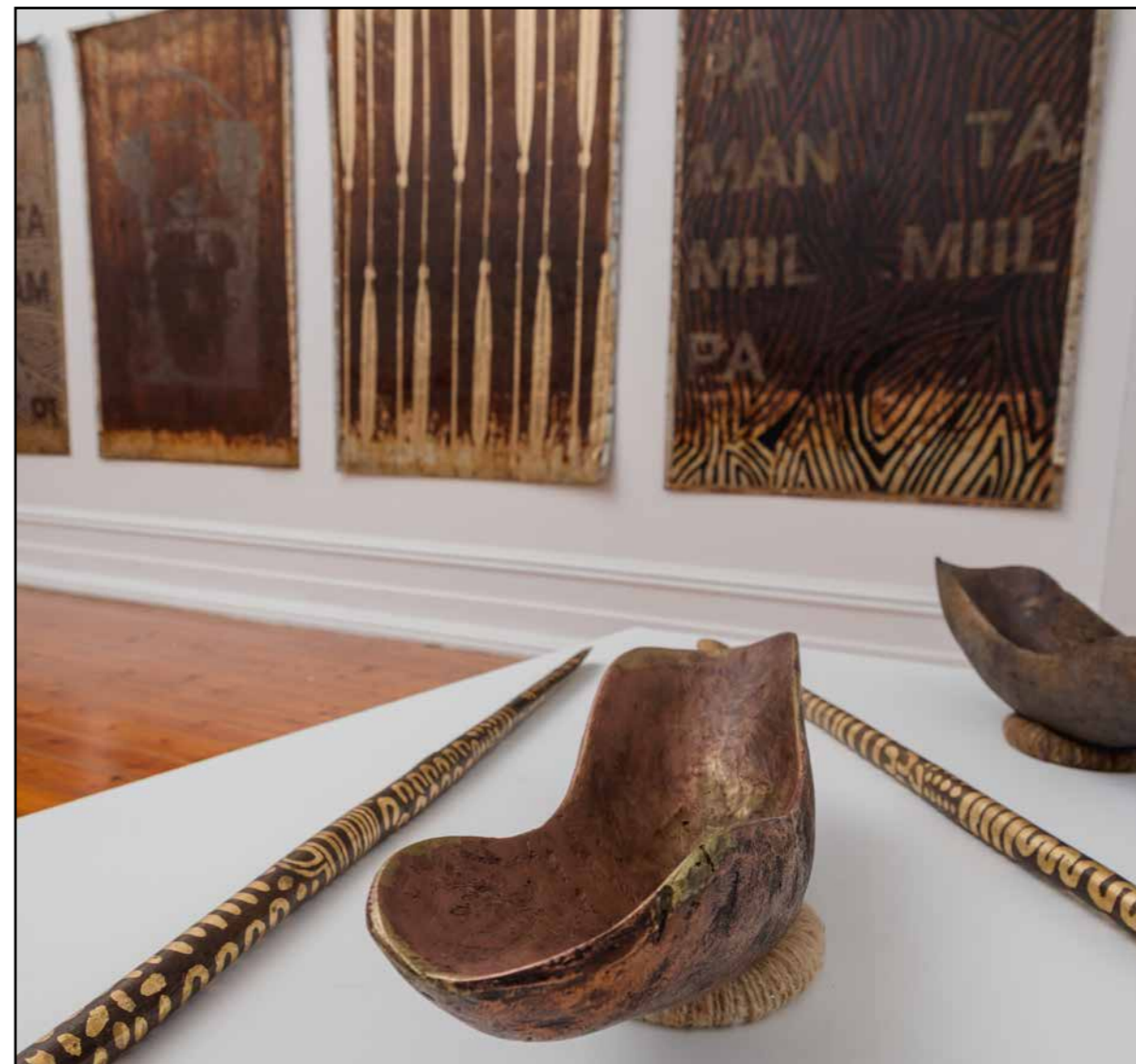
IMAGE > Robert Fielding, Routes / Roots [installation view], 2020.

Tracking the Past , 2019 carved plywood with natural pigment set of 9, 60 x 90 cm each $7,700