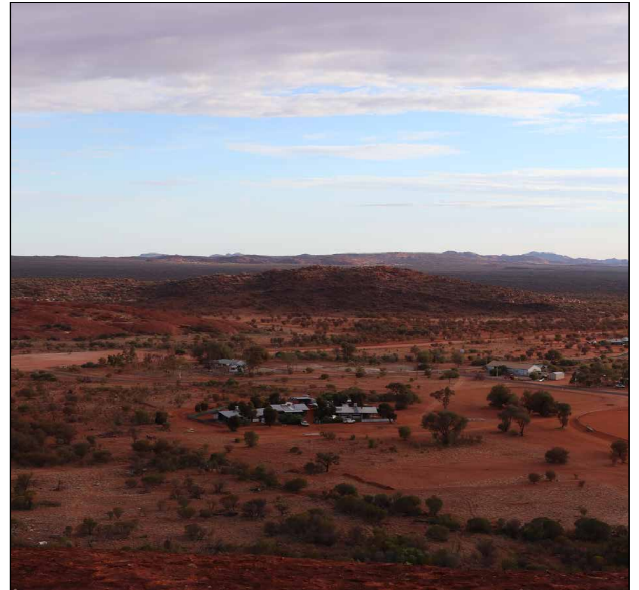
IMAGE > Aerial view of Mimili.

Mimili Community lies within the beautiful Everard Ranges, around 500 kilometres south-west of Alice Springs. At one time known as Everard Park, a cattle station, the area was returned to Aboriginal ownership through the 1981 APY Land Rights Act. Today, Mimili is home to about 250 Pitjantjatjara and Yankunytjatjara people who refer to themselves as Anangu.