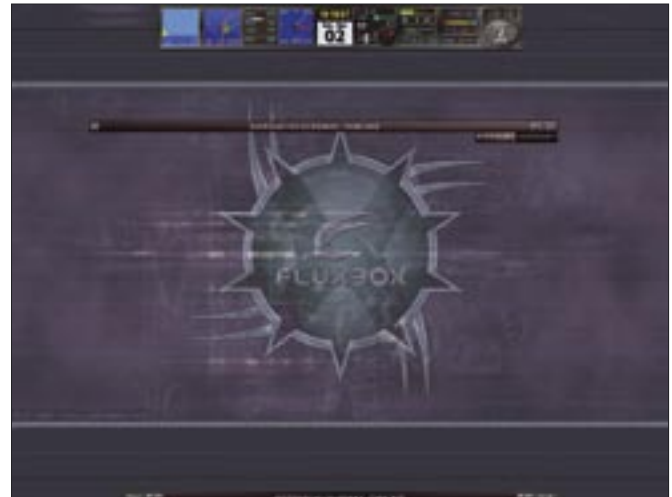
Figure 2: Drag the mouse or move a window to make waves on your desktop.

motion. Of course, this authenticity comes at the cost of a higher CPU load. The easiest way to see the difference between the quality levels is to launch the lowest level first by typing xdesktopwaves -q 0 , and then type xdesktopwaves -q 9 to switch to the highest level.