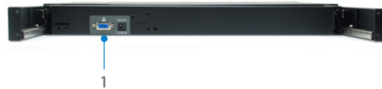
1. KCM Moudule Connector