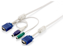
ACC-2101 1.8m PS/2 und USB KVM Kabel