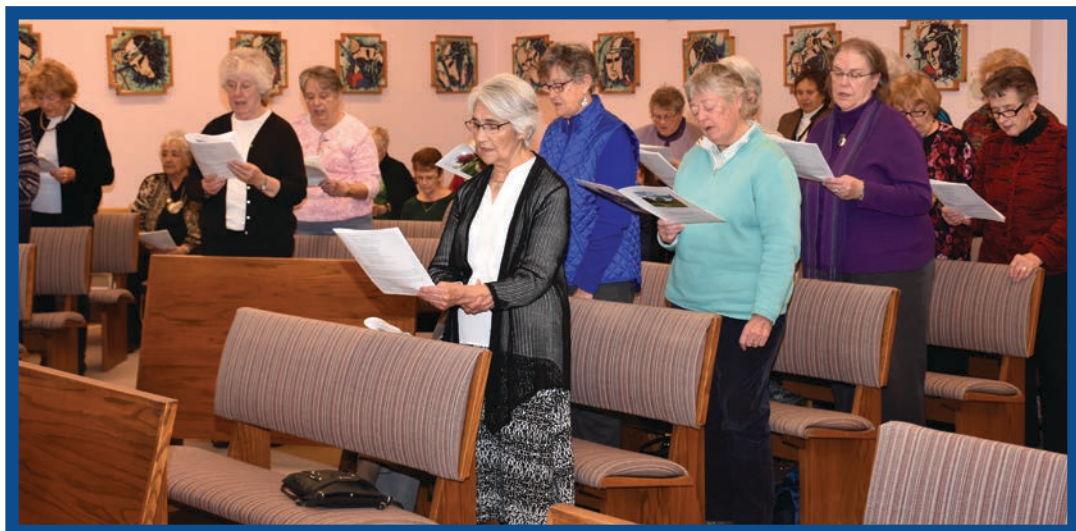
Right: Loretto Community members and friends gather at the Mass of the Immaculate Conception honoring the closing of the Center.