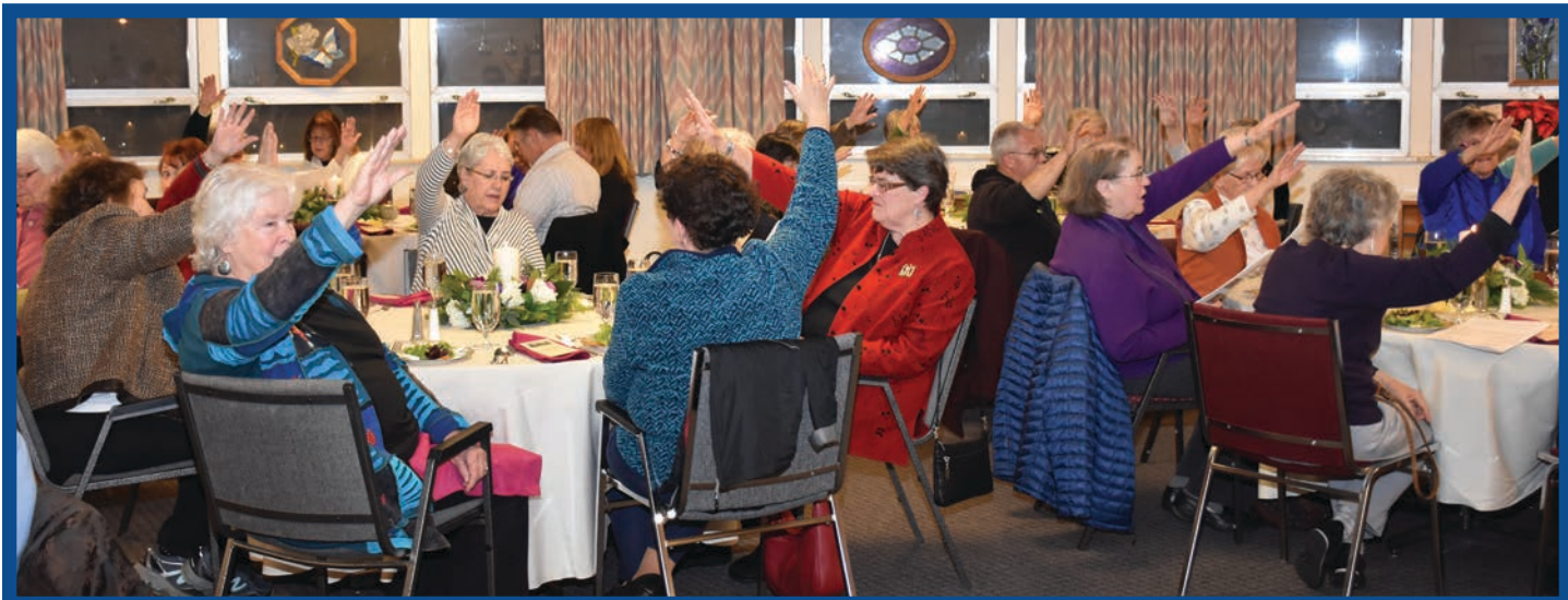
Above: Dinner guests raise their hands to bless the employees of the Center.