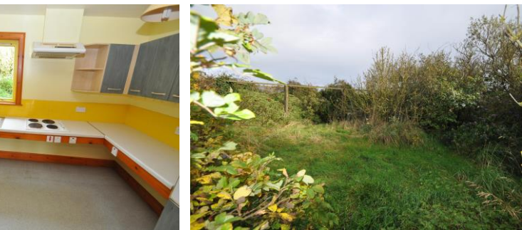
SERVICES - Mains electricity. Private septic tank.

COUNCIL TAX BAND - Band A. The Council Tax Band may be reassessed by the Orkney and Shetland Joint Board when the property is sold. This may result in the band being altered.