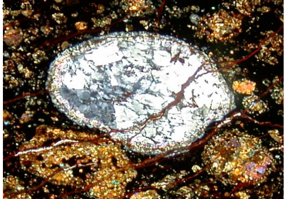
Figure 1. XPL image of Cracked Egg. FOV ~ 5x 3mm.

Analytical Technique: Two thin sections of NWA 1934 containing a 4 mm refractory inclusion were mounted on one inch round slides (Fig. 1). The inclusion's oval shape and visible brittle deformation inspired the name Cracked Egg. Optical microscope and high magnification BSE imaging were performed at the AMNH and Caltech. X-ray mapping (Fig. 2) and quantitative analyses of major