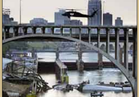
A Minnesota Army National Guard Blackhawk hovers over the bridge collapse.