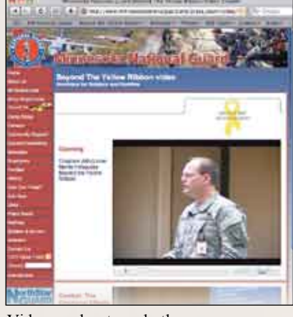
Video, podcasts and other resources on reintegration are available at www.MinnesotaNationalGuard.org/btyr