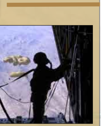
A loadmaster secures a C-130 Hercules ramp after dropping critical supplies to replenish U.S. ground forces in support of Operation Enduring Freedom.

15 Minnesota Army Guard Soldiers are currently deployed to Afghanistan as embedded Tactical Trainers for the Afghan National Army. They are scheduled to return in late spring 2008.