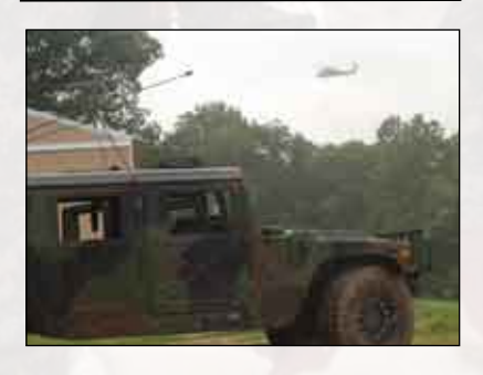
A 34th Military Police Company Humvee idles atop a hill while a 34th Combat Aviation Brigade UH-60 Blackhawk Helicopter hovers in the distance during flood-relief operations near Winona, Minn.

conducting federal combat operations overseas.