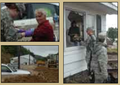
Minnesota National Guard troops were called from all parts of the state to respond to the floods in Aug. 2007 in southeast Minn.