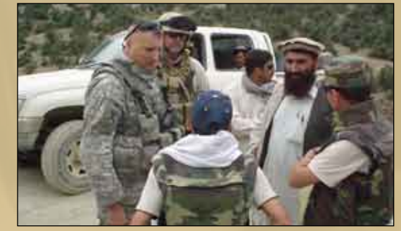
Soldiers meet with civilians as part of Afghan National Police training during Operation Enduring Freedom Sept. 2007.