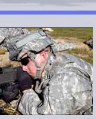
A Soldier prepares to fire a M240B machine gun as part of training for the peacekeeping mission to Kosovo.

15 Minnesota Army Guard Soldiers are currently deployed to Afghanistan as embedded Tactical Trainers for the Afghan National Army. They are scheduled to return in late spring 2008.