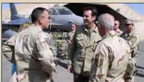
148th Fighter Wing Airmen meet with Minnesota Gov. Tim Pawlenty at Balad Airbase, Iraq.