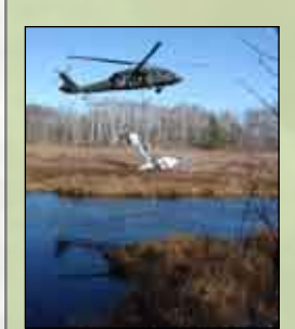
A Minnesota National Guard Blackhawk hoists a crashed plane from the water.