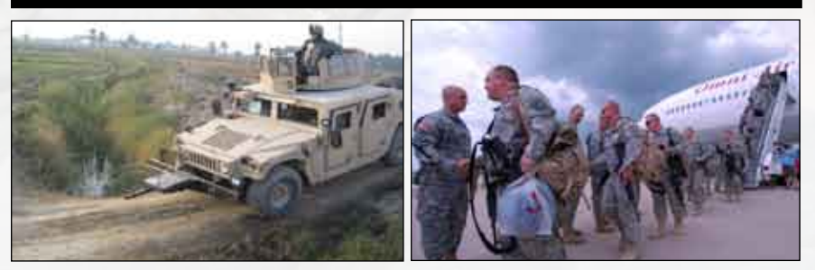
(left) Soldiers from the 1/34th BCT stop during a patrol in Iraq. (right) Soldiers greet their returning comrades as they step off the plane at Volk Field Air National Guard Base, Wisc. during the arrival of 1/34th BCT troops.