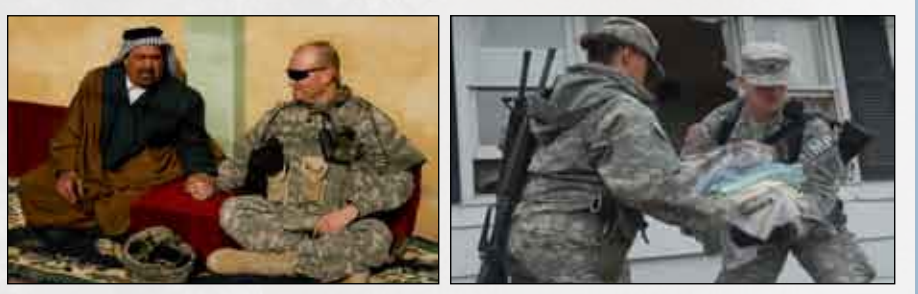
Minnesota National Guard Soldiers and Airmen conducted combat, peacekeeping, support and disaster relief operations in 14 countries in 2007.

a roadside bomb. Stroud escaped with cuts on his legs from shrapnel and a badly sprained right foot.