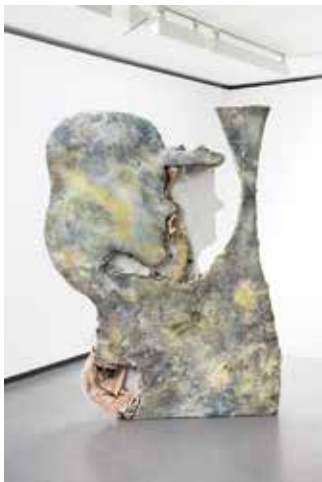
DAVID DOUARD - Under influence 2