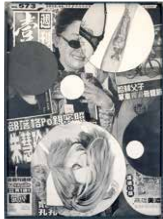
KARL HAENDEL - Inked #7 © DR ★