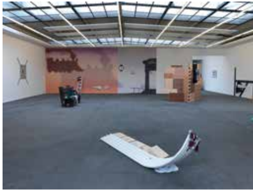
HELEN MARTEN - Take a stick and make it sharp - © Roman März