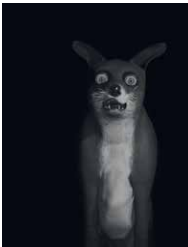
ANN LISLEGAARD - Time Machine: Details ★