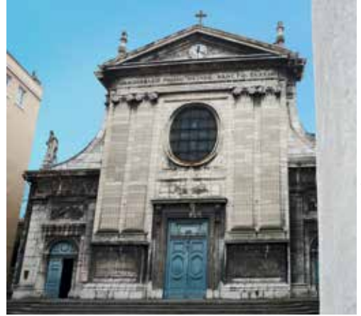
THE SAINT-JUST CHURCH