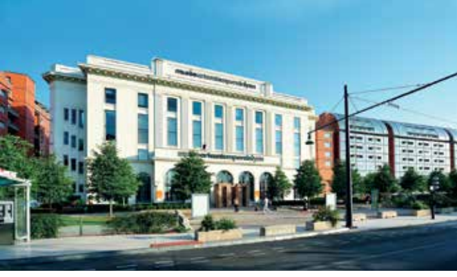
THE MUSEUM OF CONTEMPORARY ART