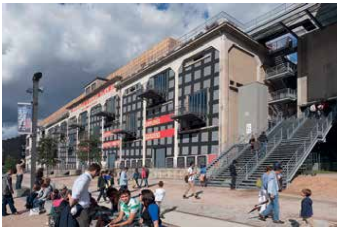
LA SUCRIÈRE - BERNARDO ORTIZ. Outside view