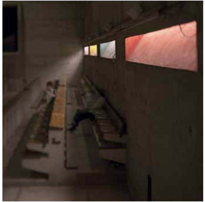
COUVENT DE LA TOURETTE