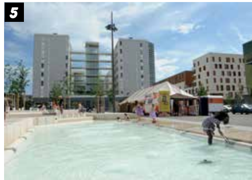
© Laurence Danière / Mission Lyon La Duchère - juin 2012