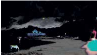
TAKAO MINAMI - Fer-Shades