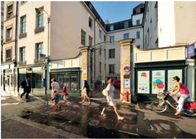
THE BULLKRIAN FOUNDATION