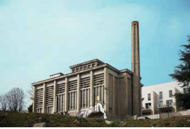
THE CHAUFFERIE DE L'ANTIQUAILLE