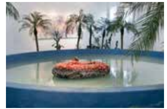
MADAIN COMPANY - Seeing One's Own Eyes ★