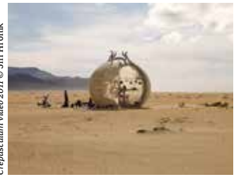
GABRIELA FRIDRUKSDOTTIR - Crepusculum video 2011