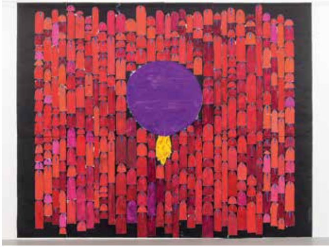
MATTHEW RONAY - Release Absorb Return ★