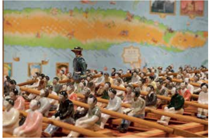
NOBUAKI TAKEKAWA - Island of Nucleires (Isac) ; Gallery in the Age of Great Knowledge (front)