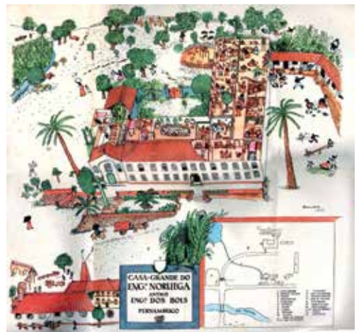
JONATHAS DE ANDRADE SOUZA - 40 biscuits candies is R$ 1,00