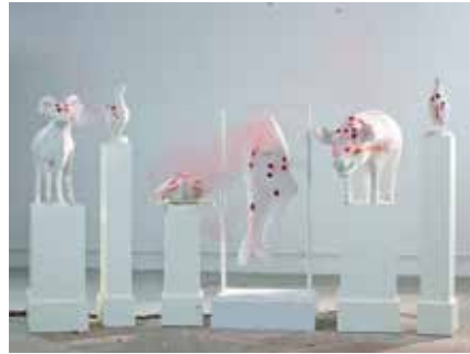
ZHANG DING - Buddha jumps over the wall