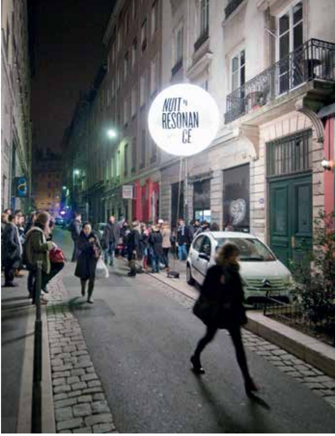
RESONANCE NIGHT 2011 - Outside view, rue des Capucins, Lyon 1