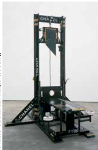
TOM SACHS - Chanel Guillotine (Greekfast noo) ★