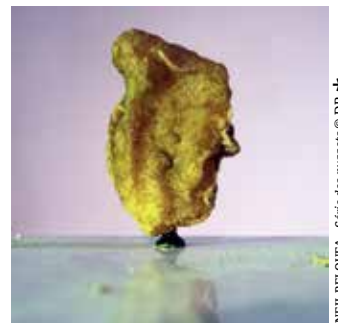
NEIL BELOUFA - Série des muggets ★