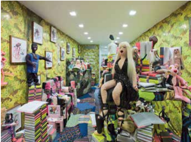
BJARNE MELGAARD - A new novel (Installation view) ★