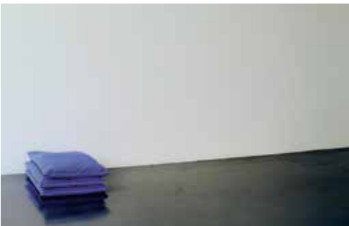
JASON DODGE - Pillows that have only been slept on by doctors... the doctors are sleeping