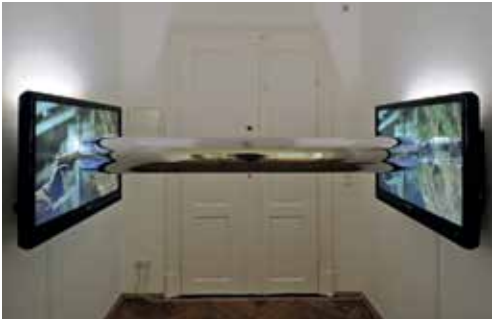
ANTOINE CATALA - TV - Tube ★