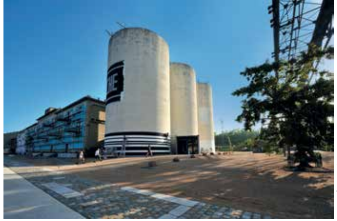
LA SUCRIERE