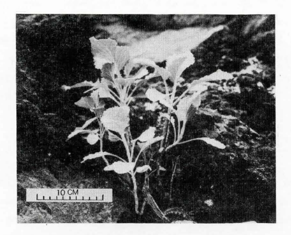
Fig. 2 - Brassica bourgeaui (Webb ex Christ) O. Kuntze growing in its natural habitat in the Canary Islands, La Palma, Barranco Jieque, February 1978.