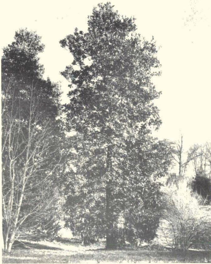
Fig. 1. Magnolia × 'Freeman' (Specimen on right). Selection with a columnar habit. Plant in 1971 was 40 feet tall with a branch spread of about 8 feet.