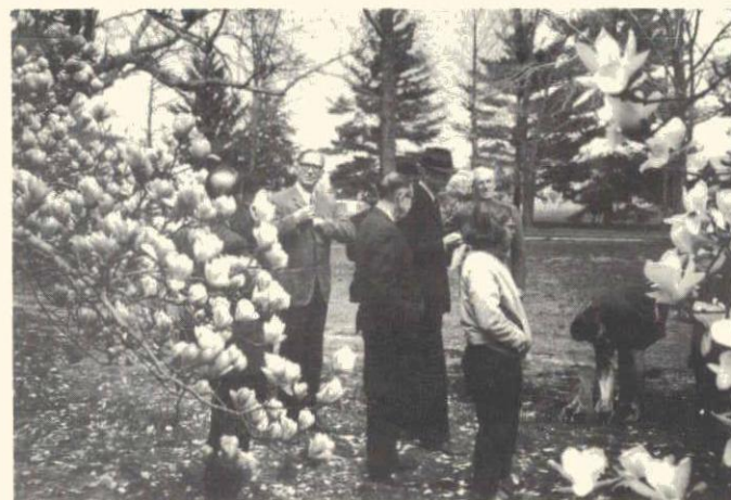
Fig. 2. Group in the Magnolia collection at Swarthmore.