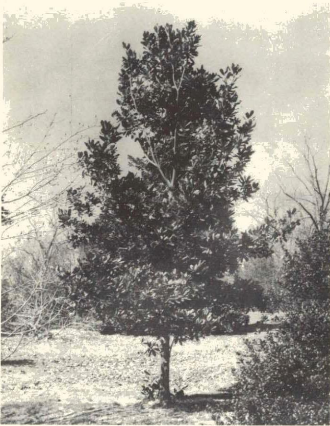
Fig. 3. Magnolia × 'Maryland'. Selection with a spreading habit. Original plant died back to the ground, but a new plant, now about 15 feet high has grown from the original stump.

The original parent plant (P. I. 358717) at the National Arboretum died to the ground several years ago from an unknown cause. Fortunately, the plant has since recovered, and a new plant now about 15 feet high, has developed from the original stump. A number of young specimens (10–15 feet high) of 'Maryland', growing at the National Arboretum and propagated from the