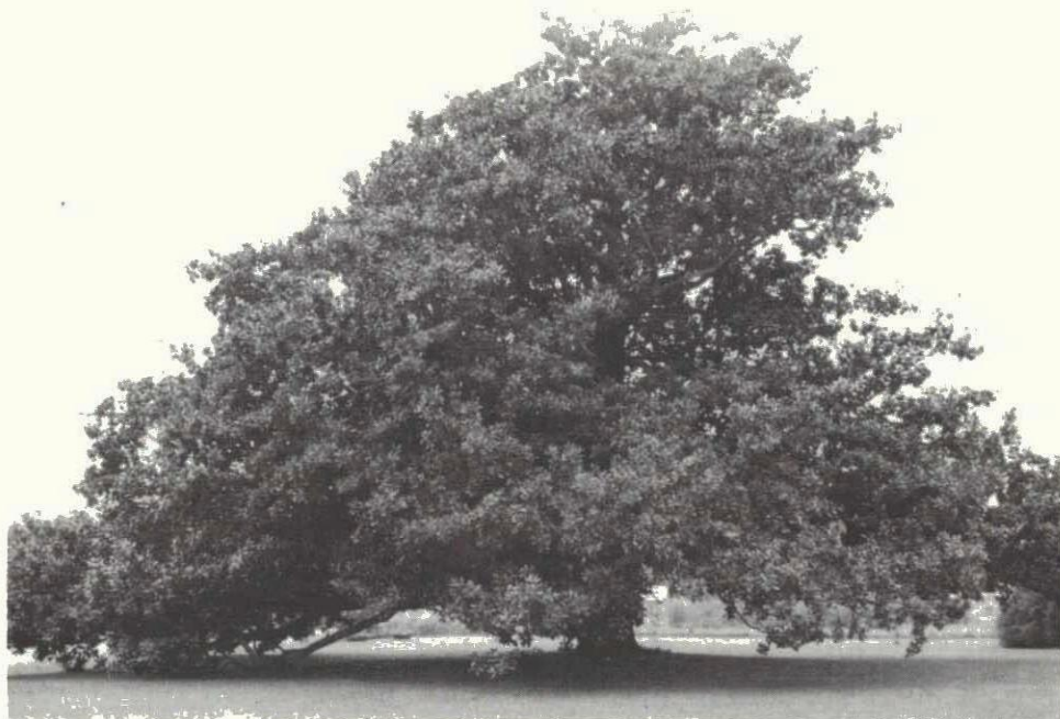
This spreading Magnolia grandiflora at Driver, Virginia, was known to be 160 years old when photo was taken in 1965.

has been mainly from variable seedling stock, though this is a species in which over 150 cultivars have been named. Selected cultivars may be more available soon in the southeast, now that reliable cutting-propagation methods have been worked out.