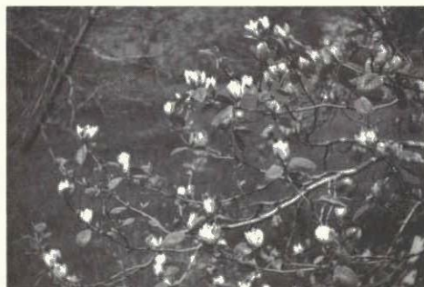
M. acuminata subcordata

M. acuminata , besides its landscape value, has been perhaps the one best magnolia understock species, if only we could get enough seedling stock of it. Working against such abundance is the