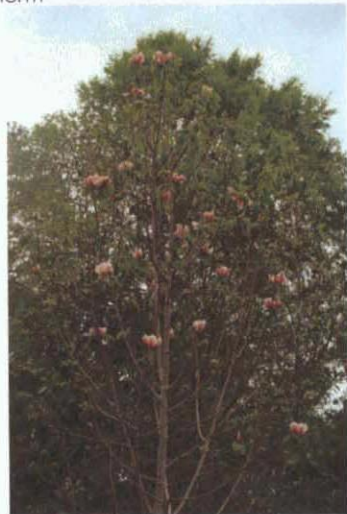
#18/3 Upright form that would make a good street tree