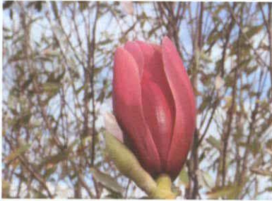
#18/1 ( Magnolia 'Red Baron' × M. 'Rose Marie') in second year of bloom

ue well into foliage emergence, for at least a 3- to 4-week bloom period, with the later blooms lighter in color.