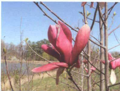
#25/1 was a little floppy in form