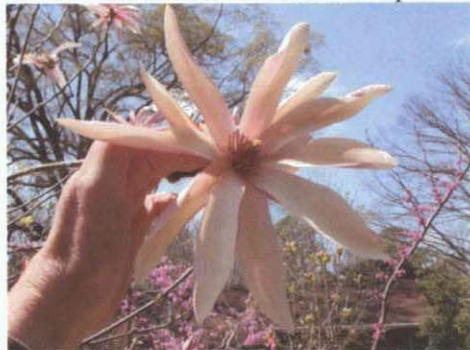
M. acuminata var. subcordata × M. 'Eskimo'

One of my first crosses, M. acuminata var. subcordata × M. 'Eskimo', produced only two seeds, and one seedling survived, the only child, which vigorously grew into a pleasing, dense, multi-stemmed oval. To my surprise, I noticed one remnant of a seed cone in the fall of its second year. The next year it bloomed prolifically. I was half hoping for a nice cantaloupe color with M. 'Eskimo's' form. What I got was a well-defined star shape with light purple overlay on a butter yellow exterior