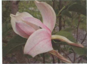
#18/2 first year of bloom was disappointingly weak in color and form

However, the next year the triplets outdid themselves. All three bloomed late, just at the time M. 'Daybreak' and M. 'Sun-sation' were in full flower. (Those two cultivars typically bloom later than most frosts.) #18/1 was a fine warm red; #18/2 was a nice medium red; and #18/3 was a good warm pink/white bicolor. All three begin bloom on bare branches and contin-