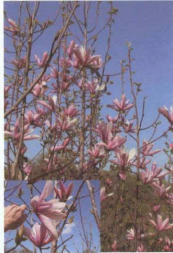
#25/3 Close up and overall form

According to mathematical calculations, there are five species included in the parental heritage of #25/1 and #25/3 seedlings: 54% M. liliiflora , 25% M. acuminata , 11% M. denudata , 7% M. sprengeri 'Diva', and 3% M. campbellii . Hopefully, the parents' hardiness trait will have been passed on to the offspring. ( M. 'First Love' and M. 'Rose Marie' are zone 5 plants.) Both #25/1 and #25/3 have long bloom periods and some repeat bloom. Both sisters are very fertile, setting seeds even if the pollen brush is just waved in their direction. All of these characteristics make them excellent choices for further breeding.