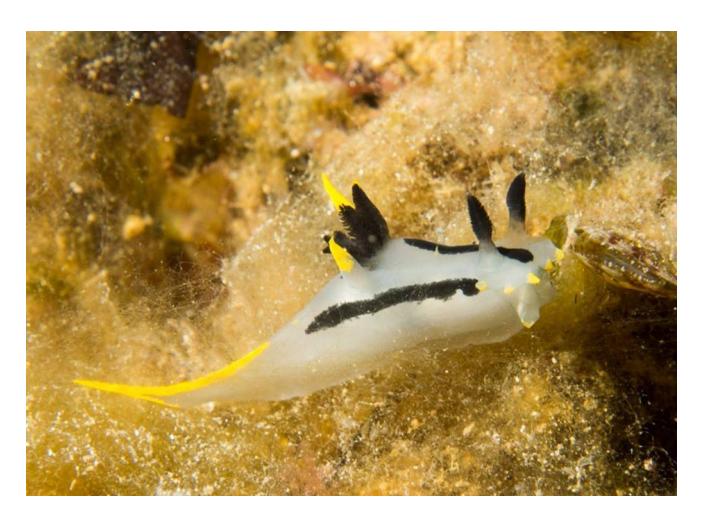
Fig. 2. Polycera capensis , Blairgowrie Pier, Port Phillip Bay, Victoria, 26 January, 2017.

the tail, six yellow velar tentacles across the head and single yellow branchial appendage each side of the gills. Images of the Beware Reef specimen and six of the other local species can be found in Burn (2015).