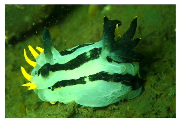
Fig. 1. Polycera capensis at Metung, Gippsland Lakes, Victoria, 13 May 2019.

On 26 and 29 January 2017, Heide Harron photographed P. capensis at Blairgowrie Marina, southeastern Port Phillip Bay (Figure 2, next page). Her suite of images includes shots of at least three specimens, two with black stripes as usually seen in animals from central and southern New South Wales (Rudnam, 1998 -2007) and one with wider black stripes especially behind the level of the gills. Several images include the wavy-edged spiral ribbon of minute white eggs typical of the species (Rudman, 1998-2007). For mating to have occurred suggests the presence of many more animals than those photographed. This report extends the