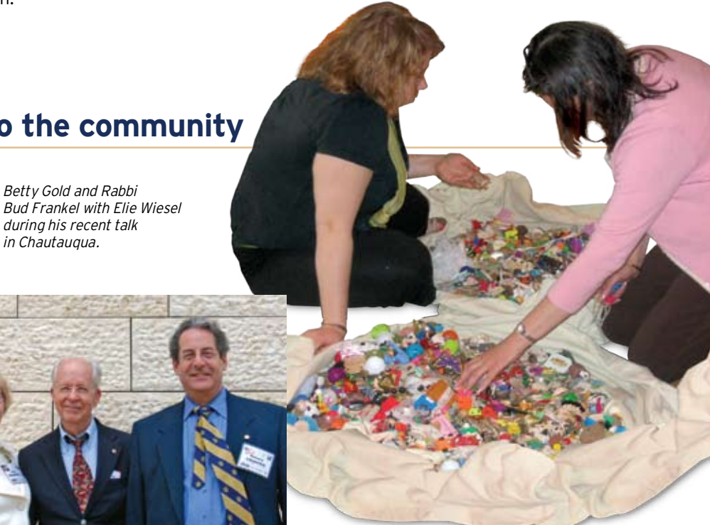
Teachers participating in our Integrating Writing & Memory Objects to Capture Your Family's History workshop sort through items to incorporate into their own memory vessels.