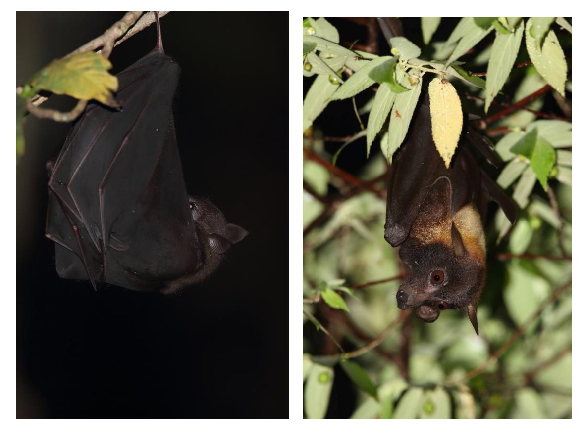
Lesser Bare-backed Fruit Bat and Long-eared Flying Fox