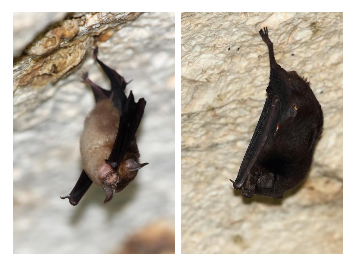
Temminck's Trident Bat and Great Bent-winged Bat, Biak

Not many mammals here but a bat cave delivered Great Bent-winged Bat, Dark Sheattailed Bat, Temminck's Trident Bat and Golden-tipped Bat. Outside, during the owling, we saw a number of Biak Bare-backed Fruit Bats and also the Nyctimene from the island, which isn't currently assigned to any known species (No either by IUCN or HBM)