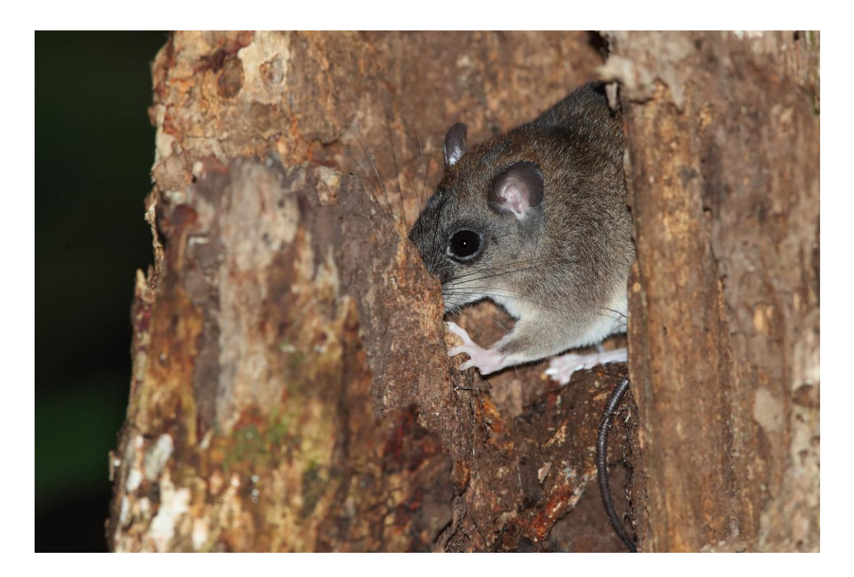
Large Mossaic-tailed Rat