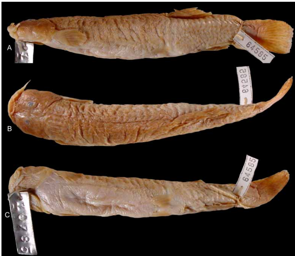
FIGURE 3. Trichomycterus iheringi , Holotype: CAS 64585 (ex IU 10785), 139.6 mm SL, Santos, São Paulo Brazil: A) lateral, B) dorsal, and C) ventral views..

specimens (Fig. 4). Mouth subterminal, its corners laterally oriented. Lower lip with conspicuous lateral fleshy lobes, internal to origin of rictal barbels. Anterior margin of upper lip rounded. Small papillae on external surface of upper lip; large papillae continuous inside of mouth to region of teeth attachment. Upper lip continuous with dorsal surface of head. Barbels long with large bases and gradually narrowing towards tip. Tips of nasal barbels reaching midway between posterior rim of eye and base of anterior opercular odontodes; tips of maxillary barbels reaching tip of posterior opercular odontodes; tips of rictal barbels reaching base of posterior most interopercular odontodes. Origin of nasal barbels on posterolateral portion of integument flap around anterior nostril. Interopercular patch of odontodes long, 20–22 conical odontodes covered by thick integument, anteriormost odontodes smaller and slightly curved medially, gradually longer and more curved distally. Opercular patch of odontodes rounded, covering posterior edge of opercle, 25–27 conical odontodes, anterior ones smaller and straight, gradually longer and curved distally. Supraorbital canal complete, infraorbital incomplete. Infraorbital anterior section pores i1 and i3, and posterior section pores i10 and i11. Supraorbital pores s1, s2 and s6 paired.