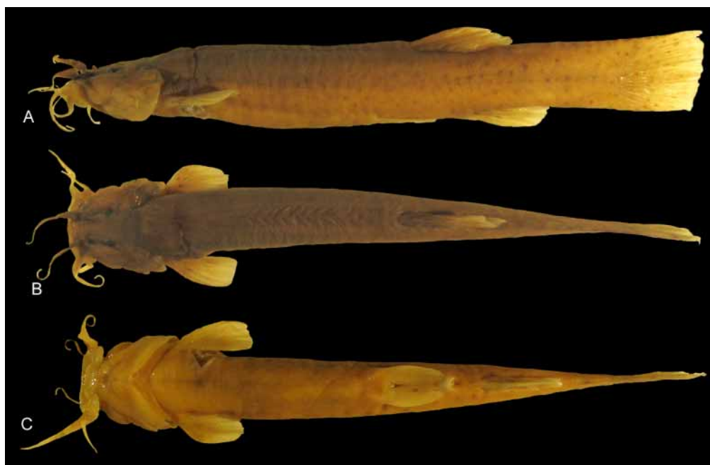
FIGURE 2. Trichomycterus guaraquessaba , Holotype, MPEG 7916, 89.1 mm SL, rio Bracinho, Fazenda Salto Dourado, Município de Guaraqueçaba, Paraná, Brazil: A) lateral, B) dorsal, and C) ventral views.

Etymology: The specific epithet “ guaraquessaba ” is derived from the name of Município de Guaraqueçaba and the Área de Proteção Ambiental de Guaraqueçaba (APA-Guaraqueçaba), the area of occurrence of the new species. A noun in apposition.