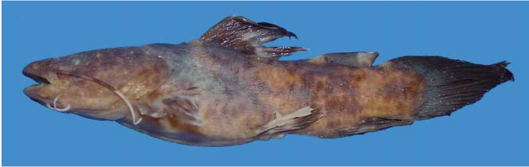
FIGURE 2. Batrochoglanis melanurus , paratype, young specimen coloration, MZUEL 3669 (60.8 mm SL).

Distribution. The new species is known only from the type-locality, córrego Cancela, affluent of rio Cuiabá, rio Paraguai basin, State of Mato Grosso, Brazil (Fig. 3).