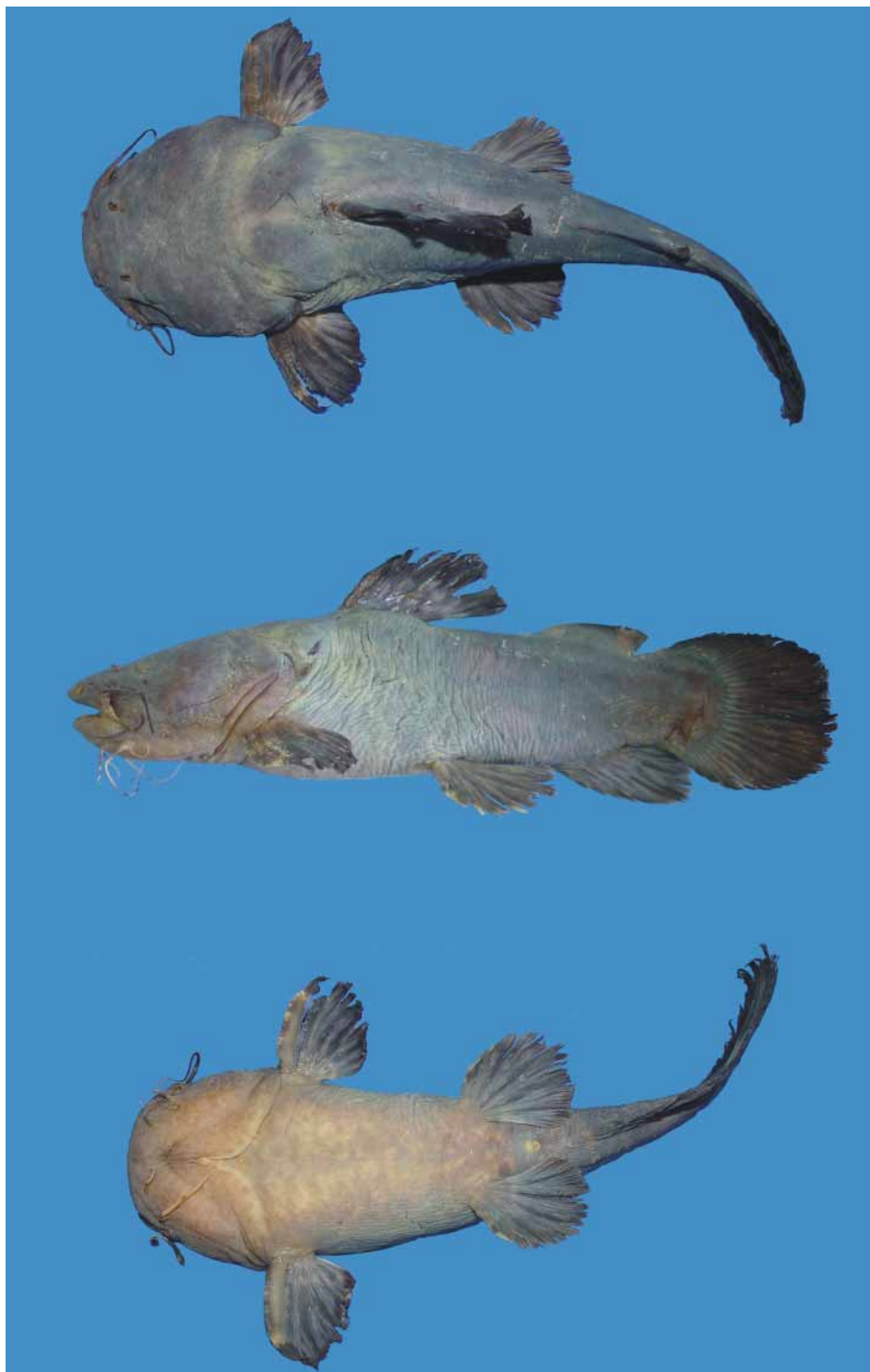
FIGURE 1. Batrochoglanis melanurus , MZUSP 87240, holotype, 136.7 mm SL; córrego Cancela, affluent of rio Cuiabá, rio Paraguai basin, State of Mato Grosso. Whitish coloration is due to dense mucus solidified after formalization.