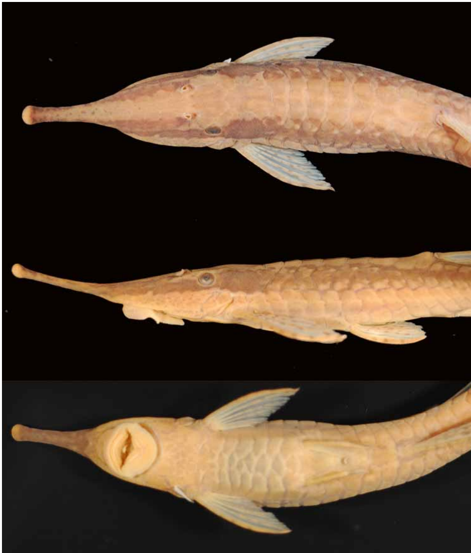
FIGURE 1. Farlowella altocorpus , INHS 99773, holotype, 170.2 mm SL, dorsal, lateral, and ventral views.

Outer portion of upper lip pigmented with small discrete spots and inner portion unpigmented. Lower inner lip unpigmented and outer side with numerous faint melanophores.