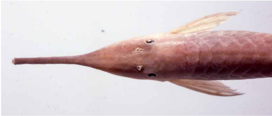
FIGURE 4. Farlowella acesrichthys , syntype, UMMZ 66480, 183.3 mm SL, photo by Michael Retzer.