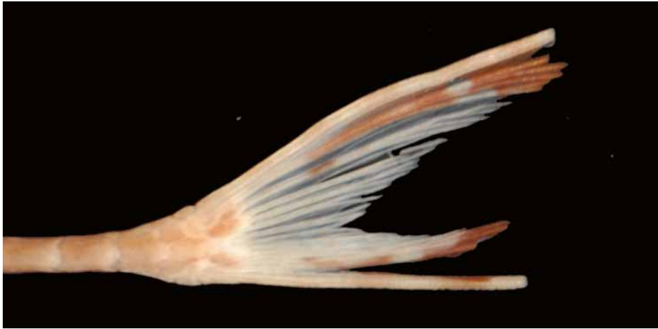
FIGURE 2. Pigmentation of caudal fin of Farlowella altocarpus , SIUC 23150, 69.6 mm SL, lateral view.

Comparisons: Farlowella altocarpus is most similar to F. hasemani but differs in having a shorter snout-mouth length relative to the pectoral length in adults (73–87% in F. altocarpus , 91–110% in F. hasemani ), and a shallower body depth relative to the pelvic fin length (69–79% in F. altocarpus , 86% in F. hasemani ), fewer posterior median lateral plates (16–18 in F. altocarpus , 19–20 in F. hasemani ), and pectoral fins reach origins of pelvic fins (vs. not reaching in F. hasemani ). (Note that in Table 14 of Retzer and Page (1996), the snout-mouth length to pectoral length ratio for F. hasemani was incorrectly given as \geq 1.0 .)