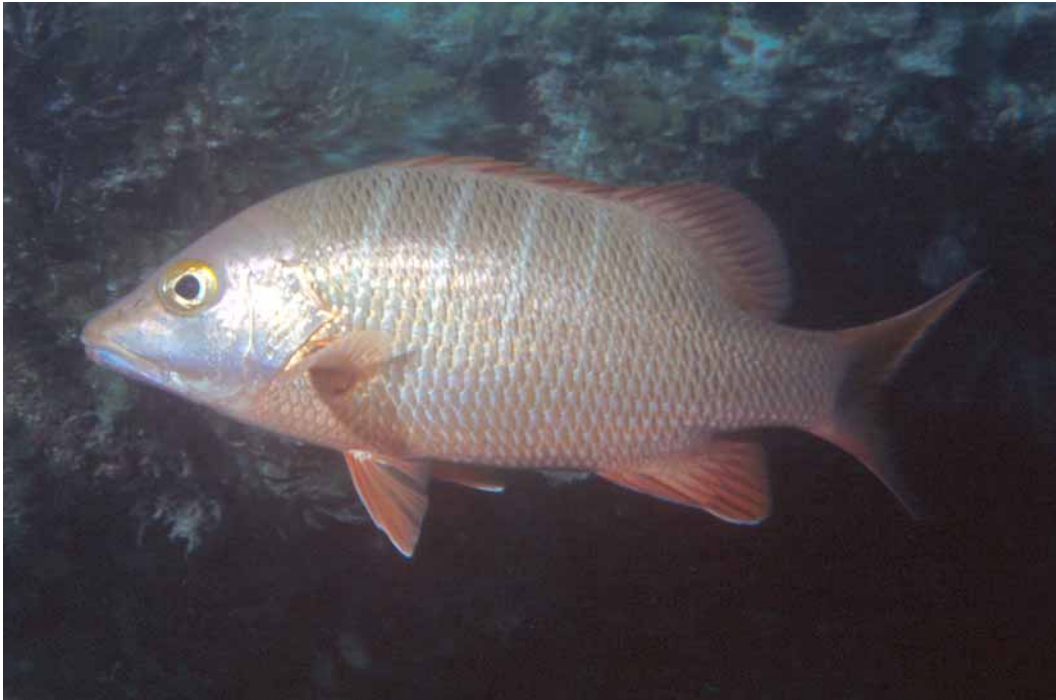
FIGURE 2. Underwater photograph of Lutjanus alexandrei . Parcel das Paredes (17°53'54"S, 38°57'13"W), Abrolhos Bank, Bahia, Brazil.