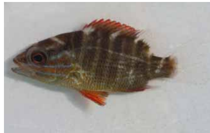
FIGURE 3. Early juvenile individual of Lutjanus alexandrei , 27 mm SL, collected in the mouth of Rio Mamucabas, Tamandaré (08°49'S, 035°05'W), State of Pernambuco, Brazil, 1 m depth (Beatrice P. Ferreira & Sérgio Resende, 18 February 2005).

Distribution, ecology and behavior. The Brazilian snapper, L. alexandrei is only recorded from the tropical portion of the southwestern Atlantic continental shelf, and has a narrower latitudinal range than other Western Atlantic species of Lutjanus . It is known from the state of Maranhão (00°52'S) to the southern coast of the state of Bahia (18°0'S), Brazil, in areas under the influence of the west-flowing Equatorial Current (northern Brazil) and the south-flowing Brazil Current (northeastern Brazil). It is apparently absent from oceanic islands. Additional collections may show an even broader distributional range for this species, as was the case with 48 other poorly known reef-fish species in the southwestern Atlantic (Moura et al. 1999).