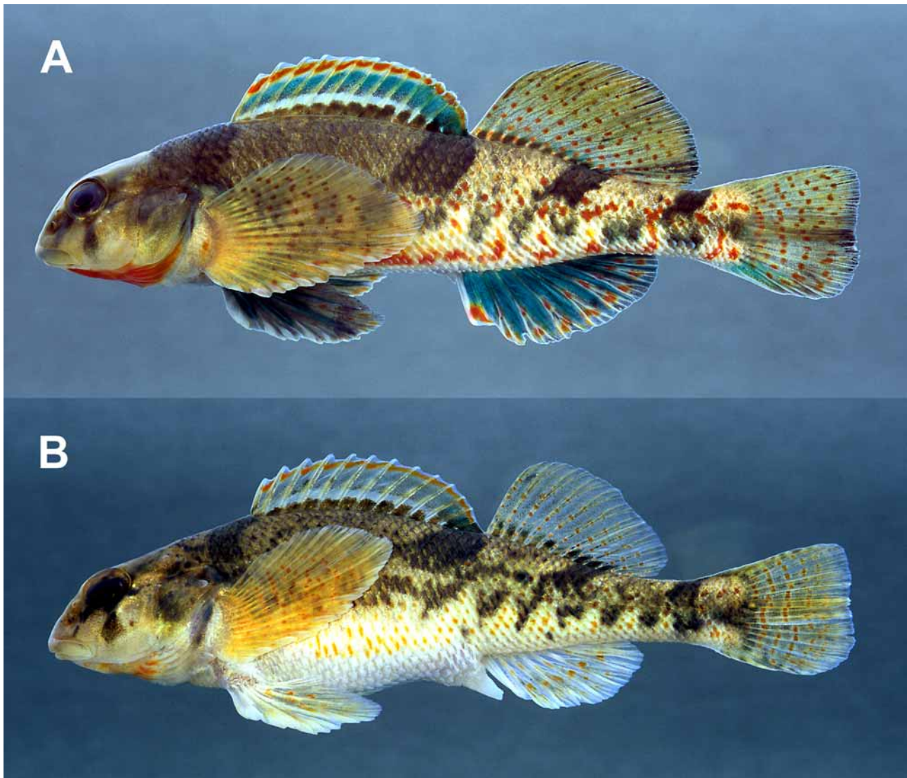
FIGURE 1. Etheostoma erythrozonum (A) male 67 mm SL, holotype USNM 391646 and (B) female 64 mm SL, paratype USNM 391647. Huzzah Creek at the Reis Biological Station, 6.2 km upstream from the Route 8 bridge, Crawford County, Missouri, 3 April 2003.

blue on the body (vs. blue present in E. tetrazonum and E. variatum ), and prominent red-orange blotches on body (vs. small orange spots in E. euzonum ).