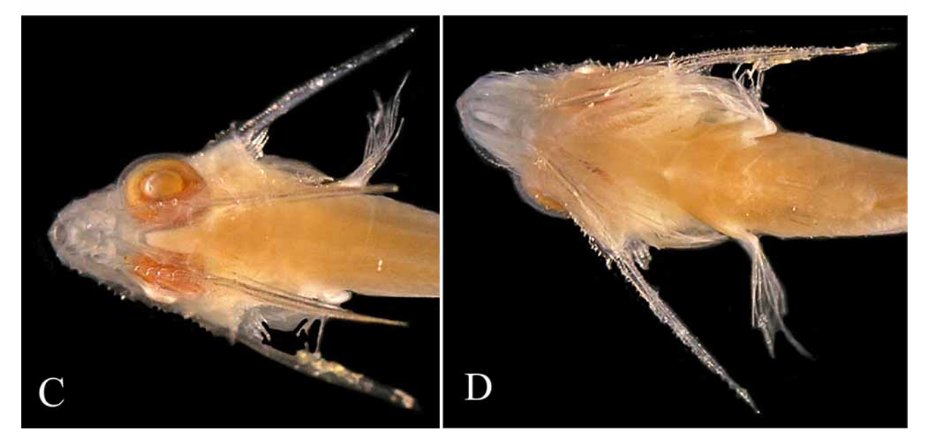
FIGURE 1 . Postflexion larvae of Symphysanodon (DZUFRJ 21382) collected in the western South Atlantic Ocean. A. Specimen of 7.63 mm SL. B. Specimen of 8.84 mm SL. C. and D. Head spination in specimen of 8.84 mm SL: C. Dorsal view; D. Ventral view.