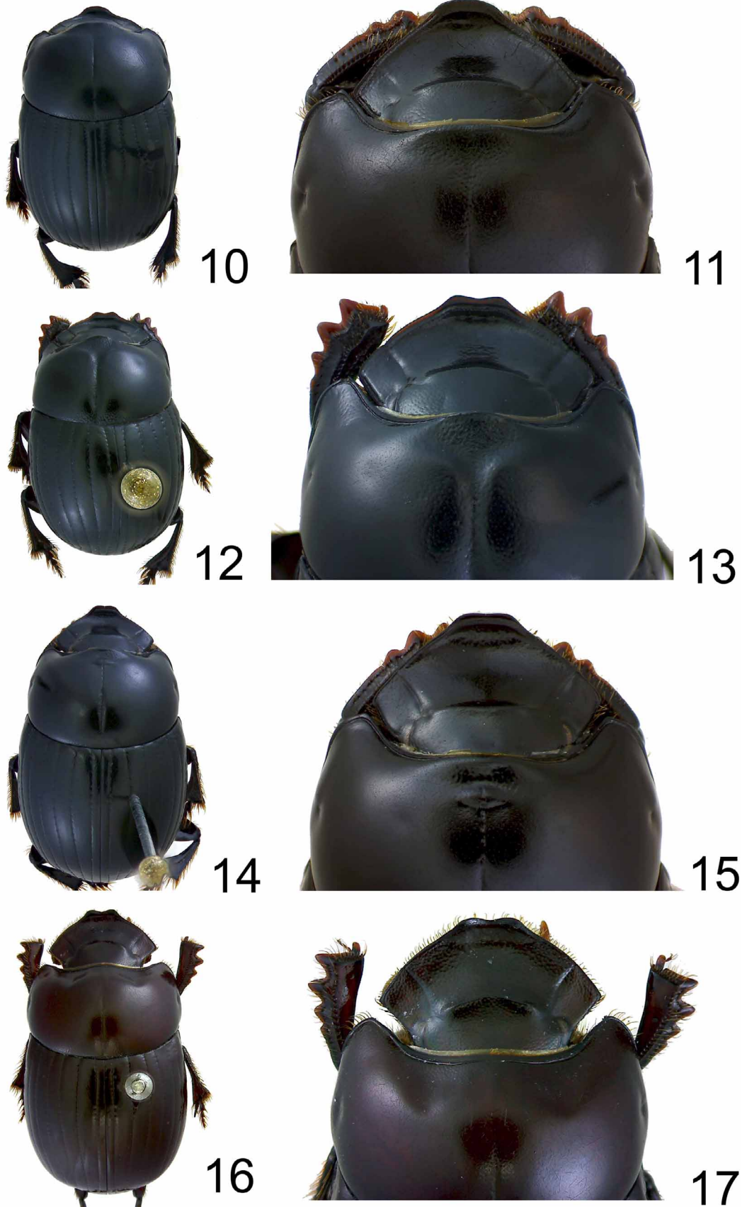
PLATE 2. Figs. 10–11, Deltorhinum guyanensis sp. nov. (paratype, female); Figs. 12–13, D. kempffmercadoi sp. nov. (holotype, female); Figs. 14–15, D. vazdemelloi sp. nov. (holotype, male); Figs. 16–17, D. robustum sp. nov. (holotype, female); Figs. 10, 12, 14, 16, habitus; Figs. 11, 13, 15, 17, head and pronotum, dorsal view.