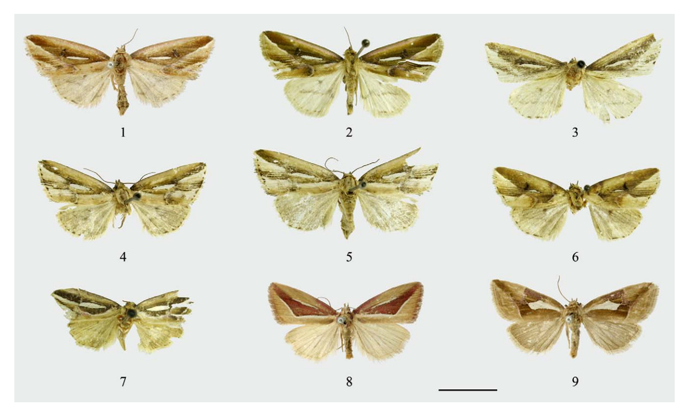
FIGURES 1–9. Adults. 1–3. Micardia pulcherrima . 1, male, holotype (BMNH); 2, male (Gyirong, Tibet); 3, male (Cona, Tibet). 4–5. M. pallens sp. nov. 4, male, holotype; 5, female, paratype. 6, M. distincta sp. nov., male, holotype. 7, M. minuta sp. nov., male, holotype. 8, M. munda , male, holotype (BMNH). 9, M. argentata , male, holotype (BMNH). Scales: 1cm.

differs from those species by an additional acute hook present on the tip of uncus; the valva has a finger-like harpe at the middle of costa and a tuberculiform process at the basal 1/4 of the sacculus.