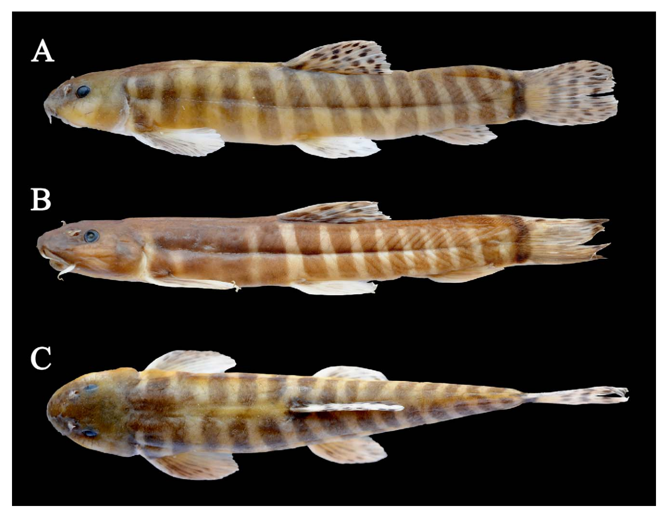
FIGURE 1 . Schistura obliquofascia , n. sp.: lateral aspects of (A) holotype, MUMF 11058, 73.3 mm SL, female; (B) paratype, MUMF 11055, 80.0 mm SL, male; (C) dorsal aspect of holotype.

Body entirely covered with embedded scales. Cephalic lateral-line system with 8 supraorbital, 4+8 infraorbital, 10–11 preorperculo-mandibular and 3 supratemporal pores. Unculi are present on lips and barbels. Lateral line complete, with 104–112 pores.