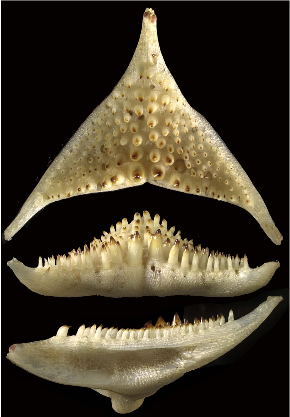
FIGURE 3. Crenicichla gillmorlisi . Lower pharyngeal toothplate in occlusal, caudal, and lateral view. From MHNG 2730.058, 131.6 mm SL. Distance between tips of posterior processes 13.1 mm.