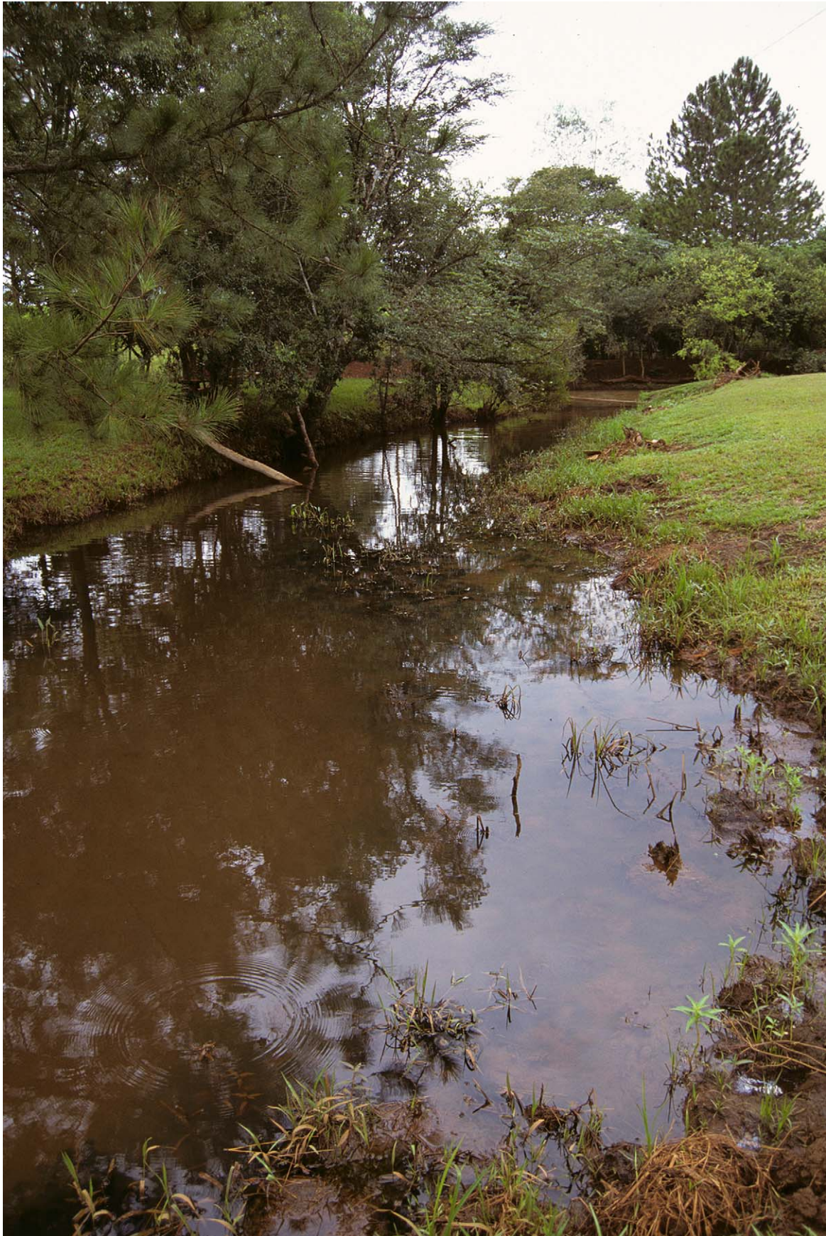
FIGURE 7. Habitat of Crenicichla gillmorlisi at Paso Itá, Hernandarias, Paraguay.