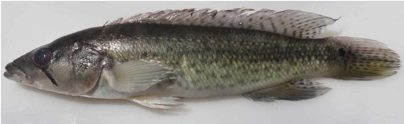
FIGURE 4. Crenicichla gillmorlisi . Adult, probable male, 137.0 mm SL. MHNIB 0234. Yguazú Reservoir at José D. Ocampos. Freshly collected 28–29 Feb 2012.

No significant differences were found in meristic data between C. gillmorlisi and C. mandelburgeri . Crenicichla “PARANÁ”, however, tends to higher scale and abdominal vertebral counts (Tables 2–3) than both C. gillmorlisi and C. mandelburgeri .