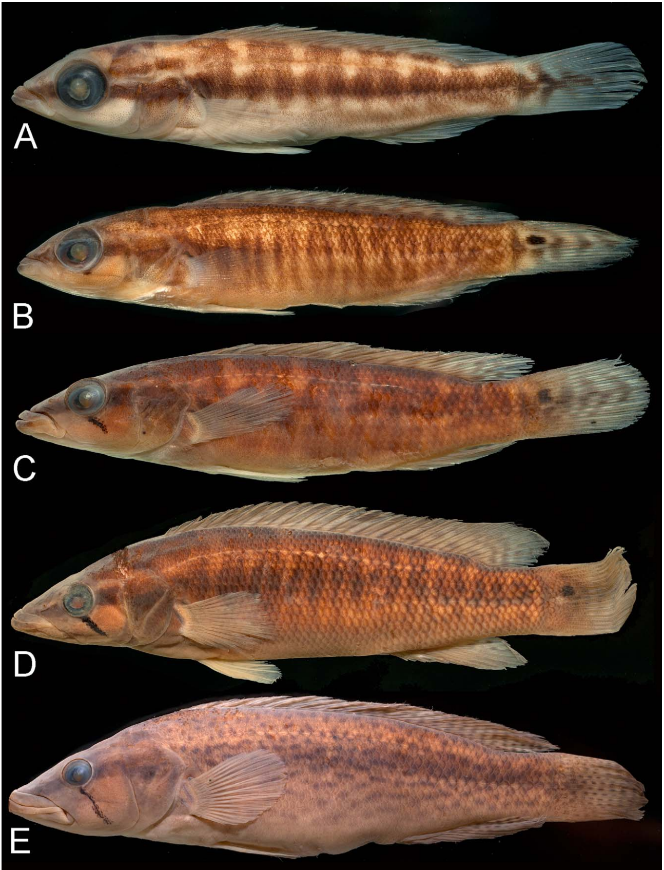
FIGURE 2. Crenicichla gillmorlisi , paratypes. A. Juvenile, 30.4 mm SL, NRM 41828. B. Young, 41.6 mm SL, MNHNP 3686. C. Paratype, adult female, 73.9 mm SL, MNHNP 3686. D. adult female, 120.1 mm SL, MNHNG 2395.11. E. Adult male, 174.3 mm SL, NRM 42452.