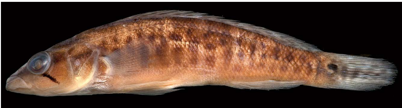
FIGURE 1. Crenicichla gillmorlisi , holotype, adult female, MNHNP 126, 76.2 mm SL. Río Acaray, dry arm below Lago Acaray.