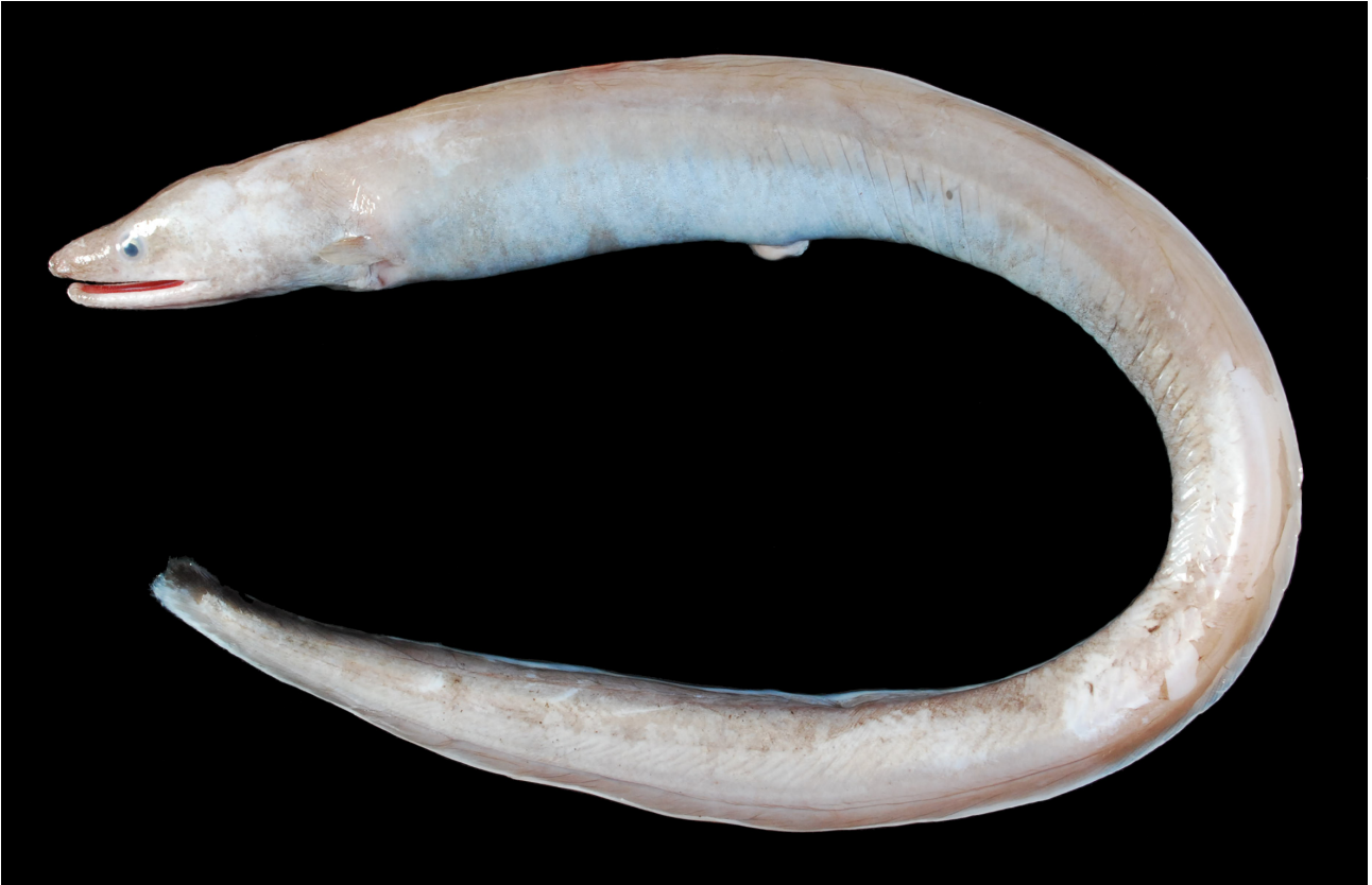
FIGURE 8. Dysommima rugosa Ginsburg, 1951. NMMB-P11131, 413 mm TL, collected from Dong-gang fishing port.

Diagnosis. Pectoral fin present; dorsal-fin origin over tip of pectoral fin, predorsal length 14.0–17.1% TL; anus posterior, more than 1 head length behind pectoral fin, preanal length 26.8–28.8% TL; trunk long, trunk length 12.8–16.4% TL; no intermaxillary teeth; 4 compound teeth on vomer; multiple rows of teeth on upper jaw and lower jaw; head pores: IO 4, SO 3, M 6, POP 0, AD 1, ST 0, F 0; lateral-line pores absent; MVF 11-28-136, total vertebrae 133–141.