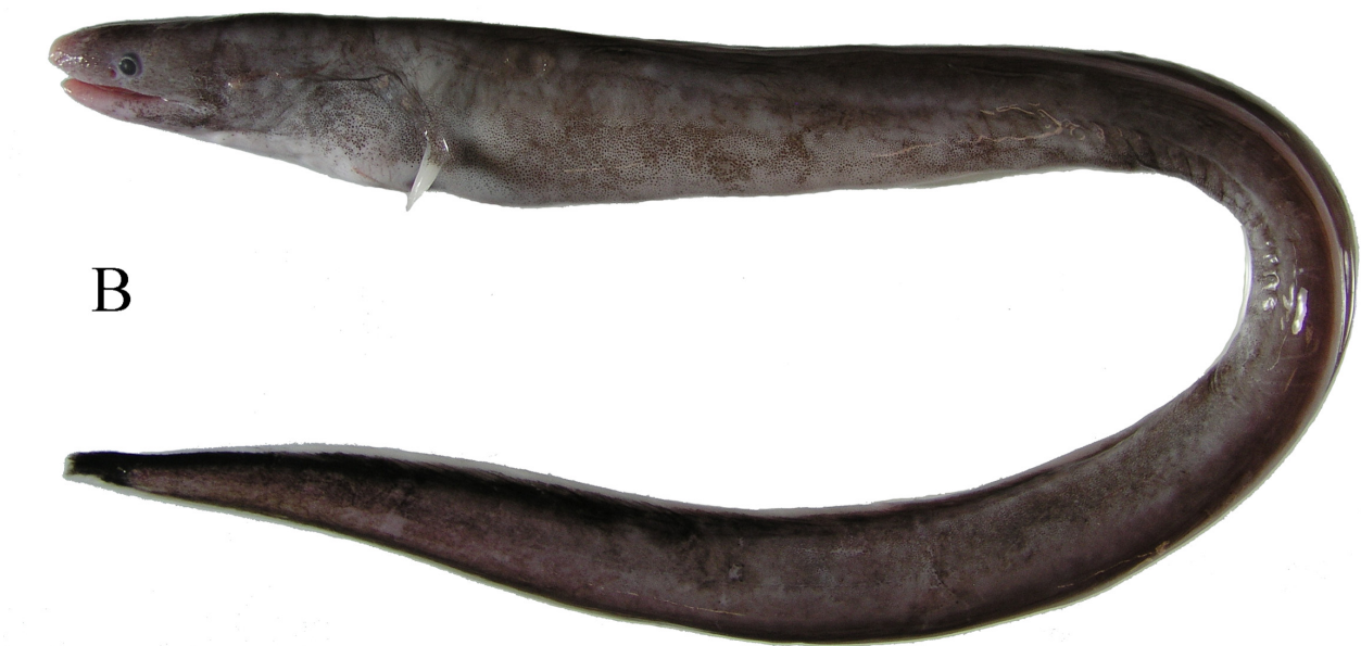
FIGURE 3. Dysomma anguillare Barnard, 1923. A. NMMB-P 11125, 1 of 9, 372 mm TL. B. Unregistered specimen, ca. 300 mm TL. Both collected from Dong-gang fishing port.

Body light brown to blackish dorsally, paler ventrally. Dorsal fin and most part of anal fin white; posterior margin of anal fin with black and white color. Caudal fin black with upper margin white.