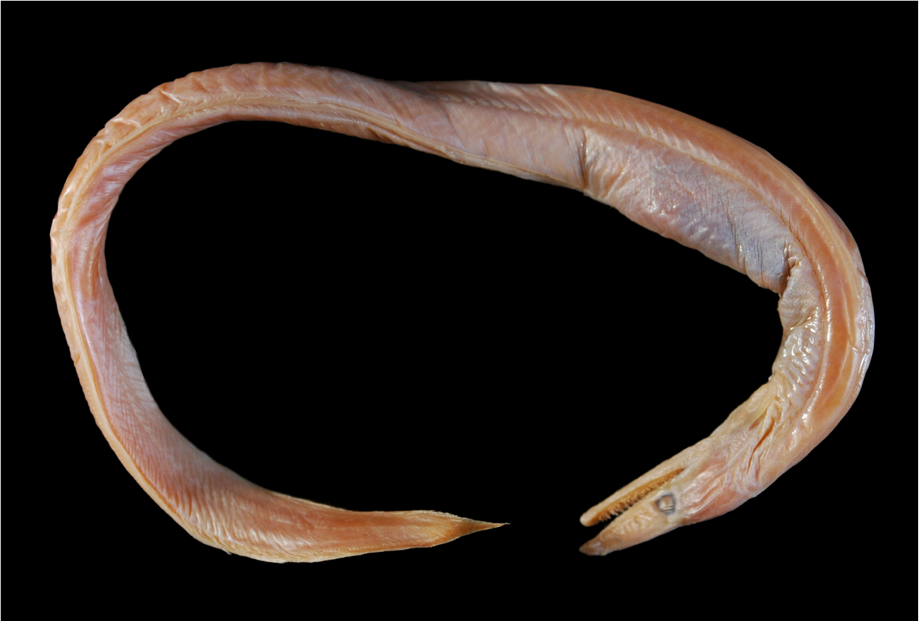
FIGURE 5. Dysomma longirostrum Chen & Mok, 2001. NSYU 2732, holotype, NSYU 2732, 196 mm TL.

Diagnosis. Pectoral fin present; origin of dorsal fin above tip of pectoral fin, predorsal length 17.9–18.6% TL; no intermaxillary teeth; snout very long, its length 25.7–32.1% HL; jaw long and slender, upper jaw length 42.0–52.1% HL; anus posterior, far behind pectoral fin, preanal length 24.0–24.3% TL; trunk moderately long, trunk length 9.7–10.3% TL; multiple rows of teeth on upper jaw; 5 compound teeth on vomer; multiple rows of small teeth on lower jaw, those on inner row larger than the rest; head pores: SO 5, IO 8 (2 between nostrils, 2 below eye, 4 behind eye), M 7, POP 2, AD 1, ST 0, F 1; lateral-line pores: predorsal 11, prepectoral 3–6, preanal 20, total ca. 77 or ca. 96, the last at 2/3 HL before caudal fin; MVF 14-24-130 (holotype only). Body uniformly brown when preserved. [Data adapted from Chen & Mok, 2001 and based on present study].