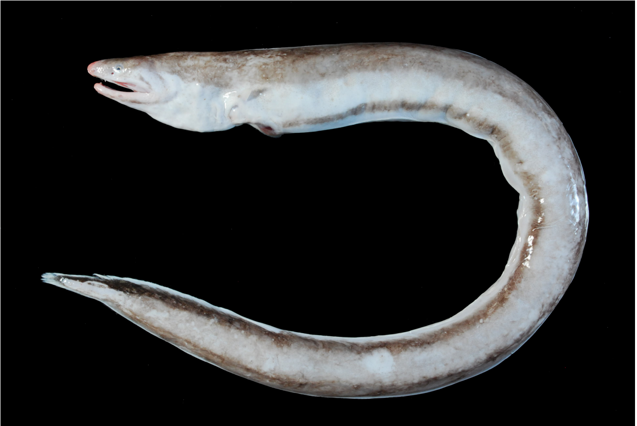
FIGURE 7. Dysomma polycatodon Karrer, 1983, NMMB-P 11128, 1 of 2, 333 mm TL, collected from Dong-gang fishing port.