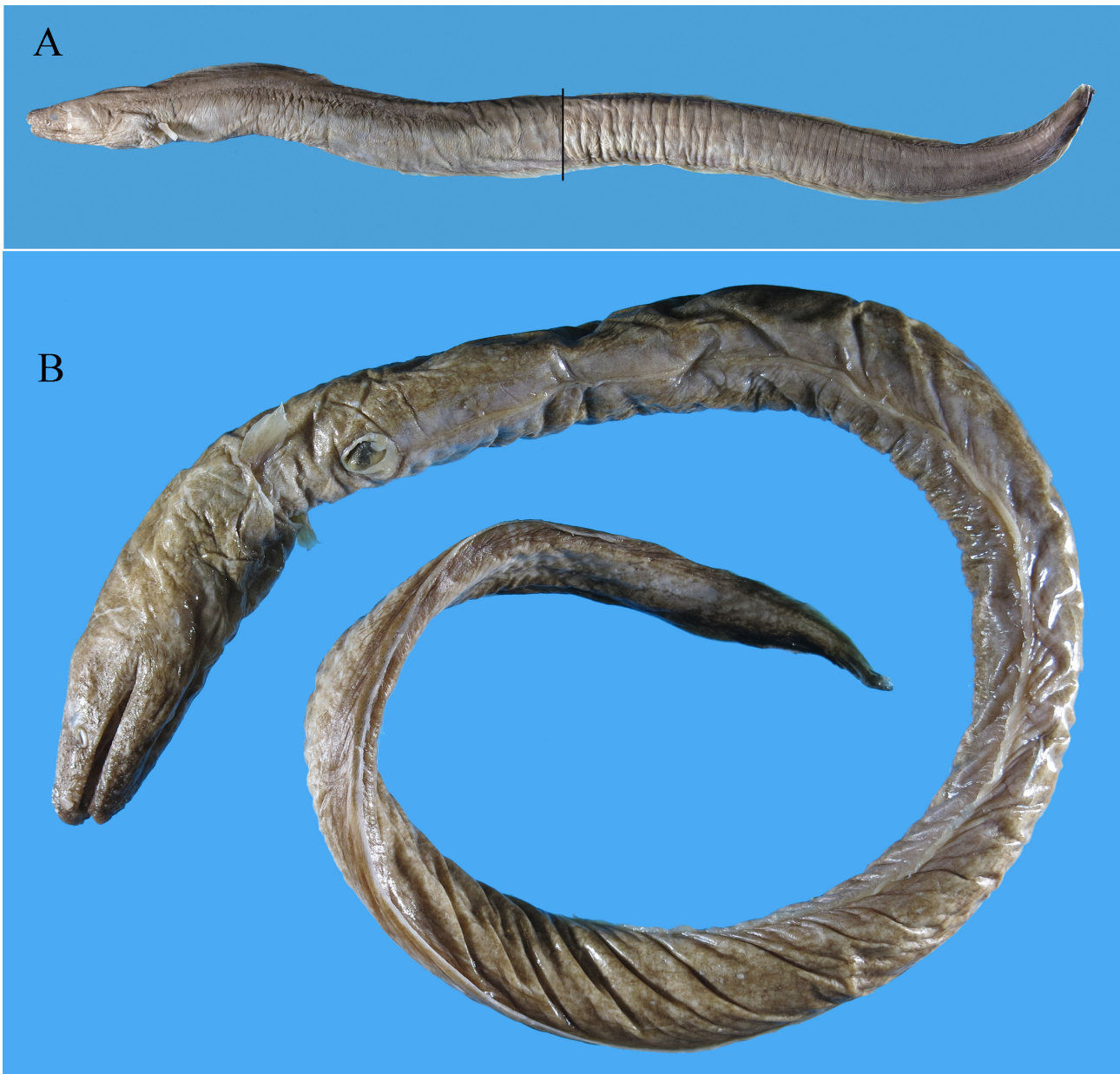
FIGURE 1. Dysomma taiwanensis sp. nov. A. Holotype, NMMB-P 11115, 496 mm TL, the black line denotes the joining of the anterior and posterior halves, which were imaged separately and merged for this figure. B. Paratype, NMMB-P 22194, 443 mm TL.

14.8 (13.9–15.1)% HL; postorbital space very wide. Anterior nostrils tubular, directed anteroventrally. Posterior nostril rounded, below anterior margin of eye, opening directed posteroventrally. Lower jaw shorter than upper, its tip reaching first pore of supraorbital series. Mouth gape far behind eye, upper jaw length 43.1 (41.1–42.2)% HL. Tongue well-attached to mouth floor. Gill opening a narrow slit.