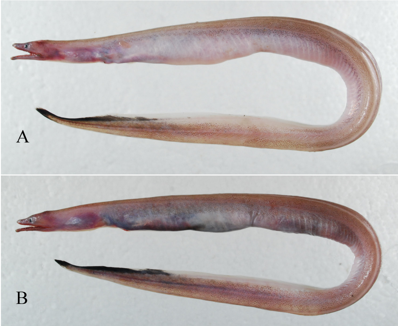
FIGURE 6. Dysomma melanurum Chen & Weng, 1967. NMMB-P10949, 2 of 3. A. 285 mm TL. B. 271 mm TL.

Paralectypes: NMMB-P3885 and NMMB-P5470, same as lectotype. Non-types: collected from Dong-gang, SW Taiwan by midwater trawl: NSYU 2732 (1, 237 mm TL). NMMB-P3885 (1, 191, partly dry), 13 Feb. 1962. NMMB-P10949 (3, 271–285), 4 Sep. 2010. NMMB-P11122 (2, 258–261), 13 Sep. 2010. NMMB-P13741 (1, 265), 29 Jul. 2011. NMMB-P13841 (1, 260), 5 Oct. 2010. NMMB-P14044 (7, 206–285), 3 Nov. 2011. NMMB-P14213 (1, 255), 20 Oct. 2011. NMMB-P15471 (3, 281–297), 2 Jul. 2011. USNM 398473 (1, 165), 13 Nov. 2009. USNM 398474 (1, 178), 13 Nov. 2009.