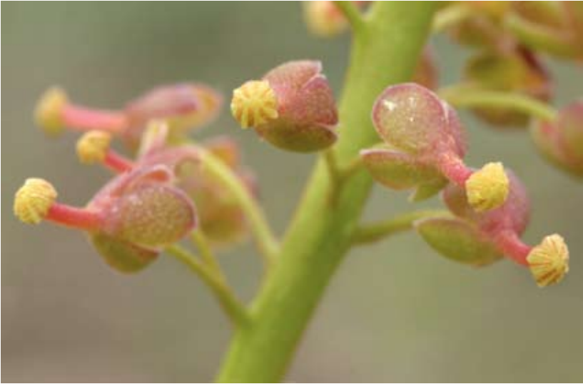
Figure 776 (above). A detail of the flowers of Nepenthes holdenii . Note the 2-flowered partial peduncles.