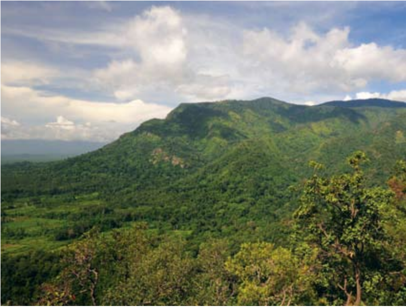
Figure 770 (above). One of the peaks of the Cardamom Mountains where Nepenthes holdenii occurs.