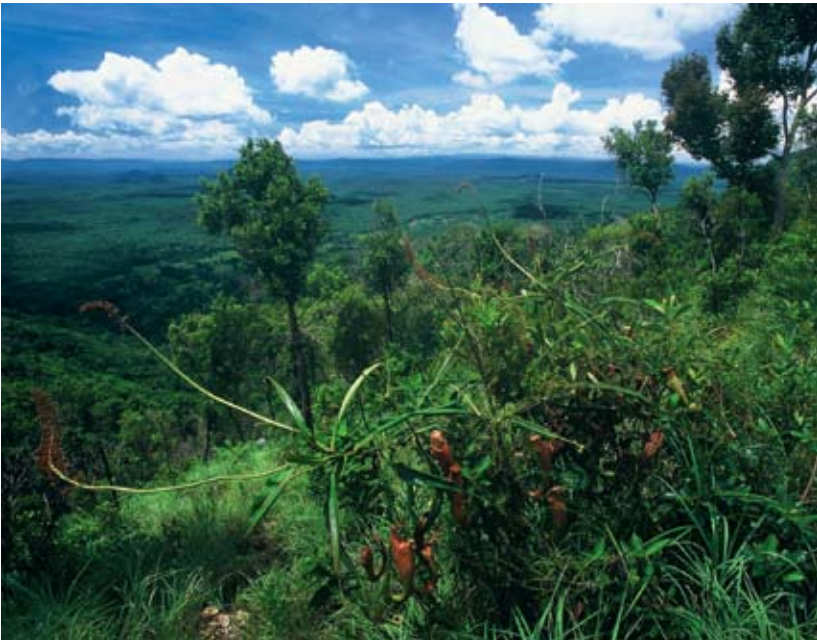
Figure 771 (above). Nepenthes holdenii growing at 700 m altitude on a sandstone ridge.