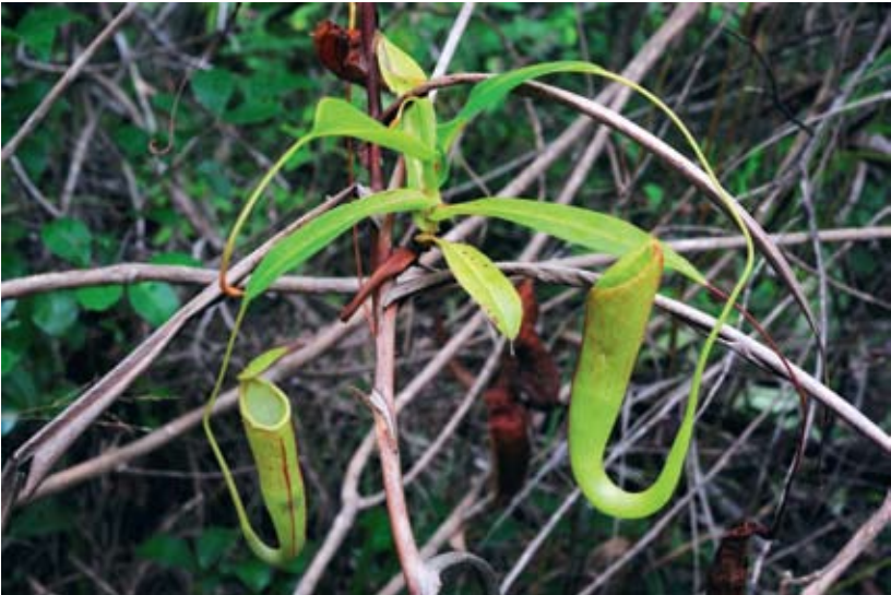
Figure 780 (above). An aerial rosette emerging from a dried climbing vine.