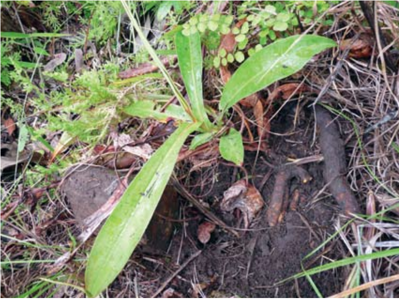
Figure 772 (above). The tuber rootstock of Nepenthes holdenii , typical of the Nepenthes thorelii aggregate.

forest. The lowland evergreen forest of the Cardamom range is mainly composed of tall trees such as Lagerstroemia (Lythraceae), Anisoptera and Dipterocarpus (Dipterocarpaceae), Ficus (Moraceae), as well as some emergent legumes, various species of bamboos, rattans and lianas are also very common. The hill evergreen forest, occurring more or less between 700 and 800 meters above sea level, is shorter and composed of trees like Lithocarpus (Fagaceae) and Syzygium (Myrtaceae) (Neang & Holden, 2008). In both localities, N. holdenii grows on steep ridges in peaty soil, in bright to fully exposed areas (Figure 771). The first locality ( Mey 1 , Neang & Holden 1, 2, 3, 4, 5, 6 ) is semi-exposed. Plants grow in full sun or under the part-shade of short trees. The forest floor is generally covered with leaf litter. Some small, undiagnosed lithophytic Orchidaceae, large succulent plants which look like species from the tribe Euphorbieae and a species of terrestrial mistletoe belonging to the genus Dendrophthoe Mart., occur in this area. The second locality ( Mey 7 ) is open and drought appears to be severe in the dry season. Nepenthes holdenii occurs on steep ridges at the foot of a loose network of short trees and pines. A species of fern and species of myrmecophilous plants like Hydnophytum Jack (Rubiaceae), Dischidia rafflesiana Wall., as well as