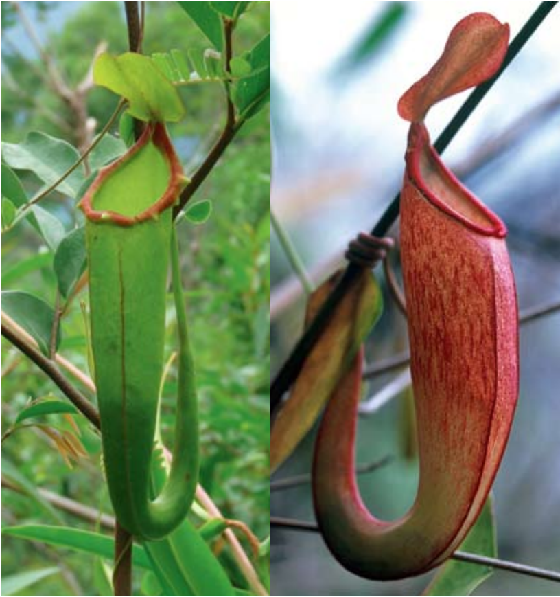
Figure 781 (above left). A green upper pitcher with a reddish, sinuate peristome. Figure 782 (above right). The upper pitcher of a pink variant of Nepenthes holdenii

linear to linear-lanceolate leaves and pitchers born on long tendrils. Nepenthes holdenii and N. chang also share similar habitat preferences as both species usually occur on open steep peaty terrain surrounded by forests. Although, flowering N. holdenii are readily distinguished from its closest relatives by its male and female inflorescence structure, it can be also be distinguished in vegetative conditions from N. chang by its infundibular upper pitchers (vs. tubulose), its glabrous stem and leaves (vs. hairs on all plants parts except adaxial surface of leaf) and the sinuated peristome (vs. cylindrical peristome and often larger at the sides of the pitcher opening); from N. kampoiana , it can be distinguished by the infundibular upper pitcher (vs. obovate or ovate in the lower