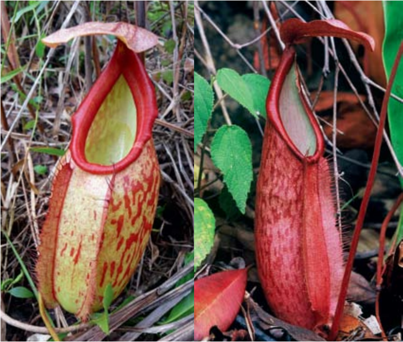
Figure 778 (above left). Most of the lower pitchers are ovate in shape and have a slightly sinuate peristome. Figure 779 (above right). A lower pitcher exhibiting prominent red colouration.