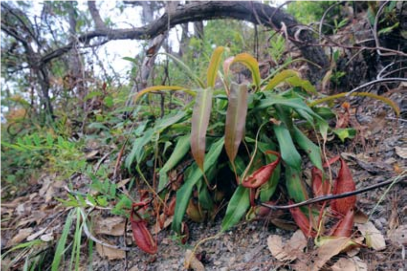
Figure 775 (above). A rosette plant growing during the wet season. Note the pine leaves.