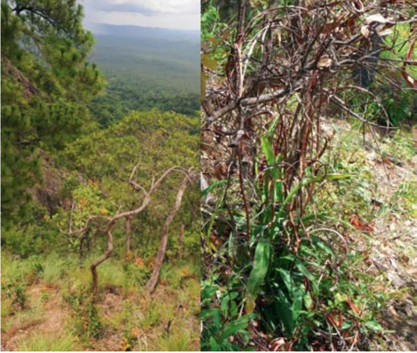
Figure 773 (above left). The habitat of N. holdenii can be very dry even during the wet season. Figure 774 (above right). A large rosette of N. holdenii growing back on the wet season. Note the dead climbing vines, remnants of the dry season.