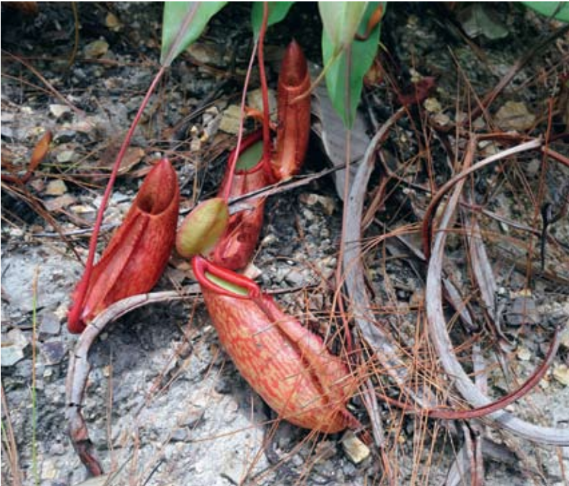
Figure 777 (above). Lower pitchers of Nepenthes holdenii are often speckled with red blotches.