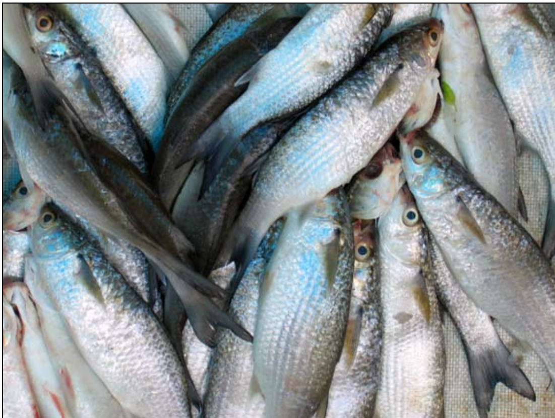
Suva Fish Market