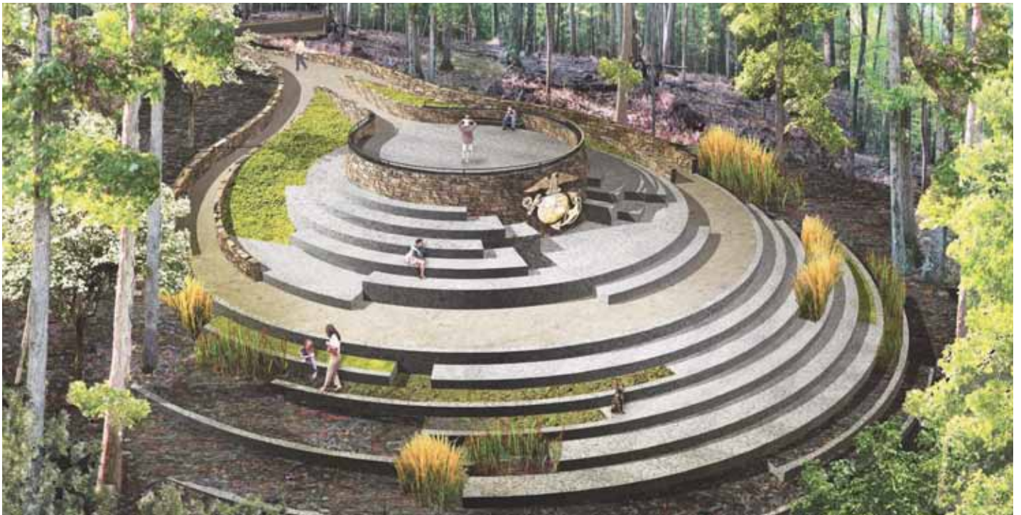
SEMPER FI PARK

“When the Marine Corps Heritage Foundation announced it was seeking donations to construct exhibits in the