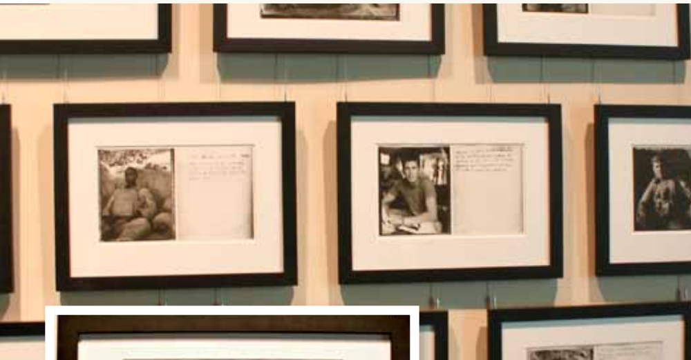
PHOTO CAPTIONS FROM MUSEUM DIRECTOR, LIN EZELL.