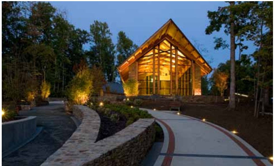
Semper Fidelis Memorial Chapel