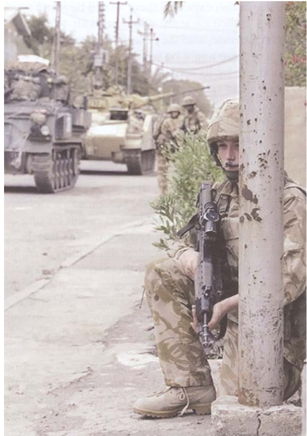
As British troops, supported by tanks and armored personnel carriers, moved into Basrah, they encountered minimum resistance and the city fell without heavy fighting or loss of life.

This remarkable story, which begins by reflecting Shia fears of abandonment by the Coalition, conveys something of the British sense for how to handle the transition to Phase IV, post combat operations. With his experience in Northern Ireland and the Balkans, the average British soldier may be one of the world's foremost experts on the three-block war. He could fight a conventional battle, defend himself against a guerrilla or paramilitary threat, and conduct humanitarian operations. He excelled at most of these tasks in southeastern Iraq. As early as 1 April, in Az Zubayr, British soldiers started to shed their helmets and patrol in berets. In Az Zubayr, Basrah, and, later, in