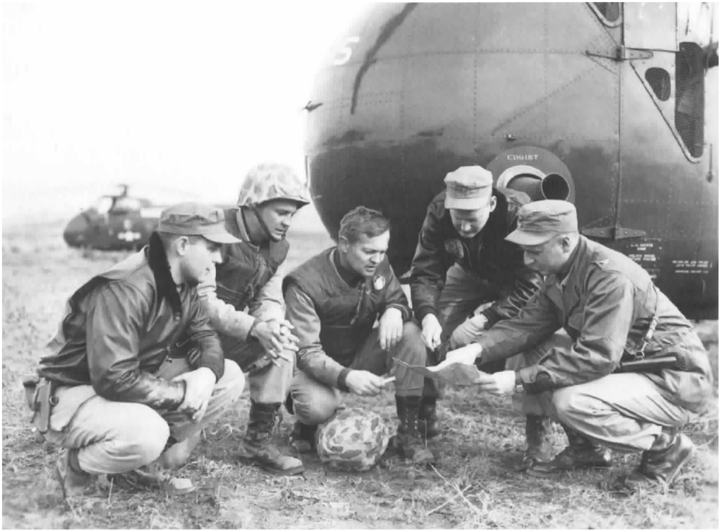
1st Air Delivery Platoon Historical Diary Photo Supplement, Feb53