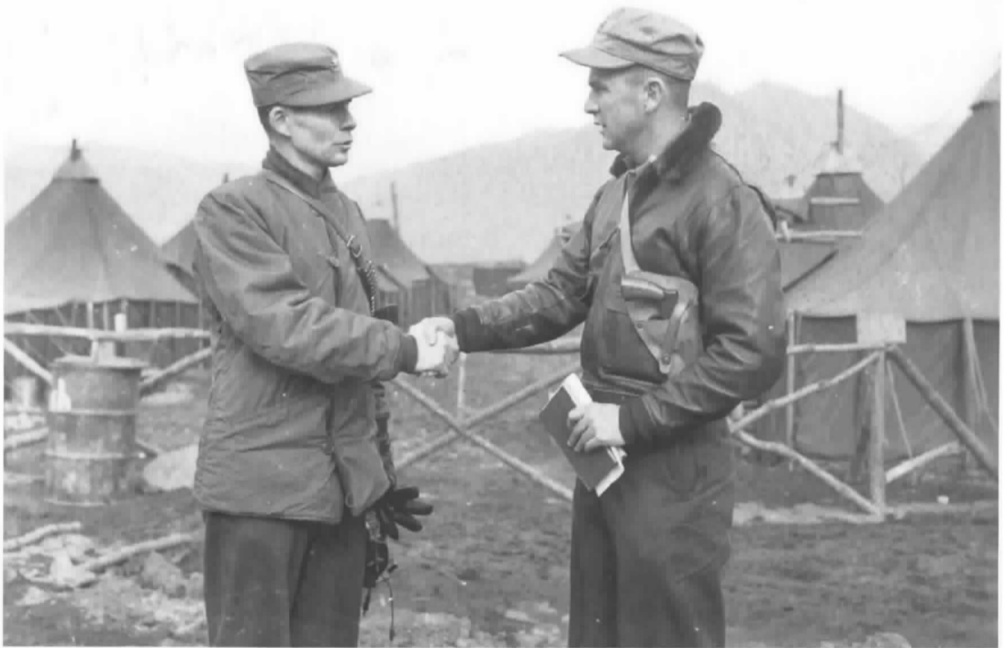
HMR-161 Historical Diary Photo Supplement, Nov-Dec51