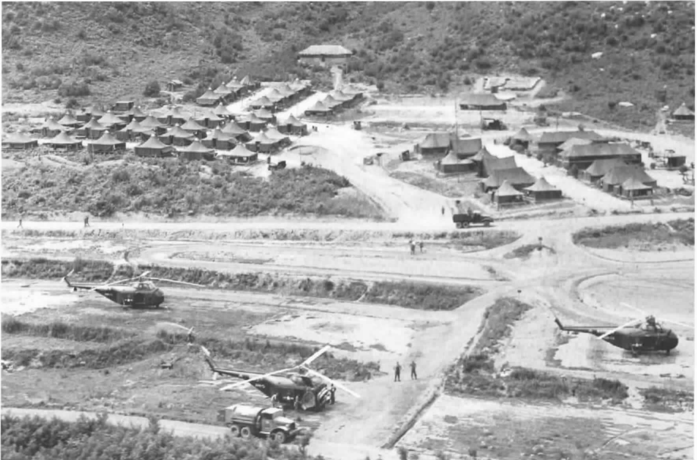
HMR-161 Historical Diary Photo Supplement, Jul52

In March 1952, the 1st Marine Division moved from the Minnesota Line located in central Korea to the Jamestown Line in western Korea. HMR-161 likewise relocated its forward base to A-17 (Yongpu-ni), while the rear echelon's maintenance facility was moved to A-33 not far from the massive supply base at Ascom City outside the capital of Seoul.