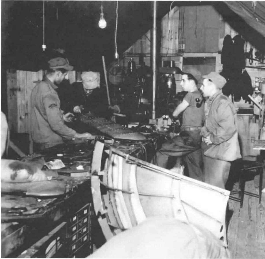
HMR-161 Historical Diary Photo Supplement, Jan52

The Marine metal shop was located at K-18 airdrome near Kangnung in central Korea. This major maintenance facility served HMR-161 which was flying from the forward strip X-83 at Chodo-ri, behind the Minnesota Line.