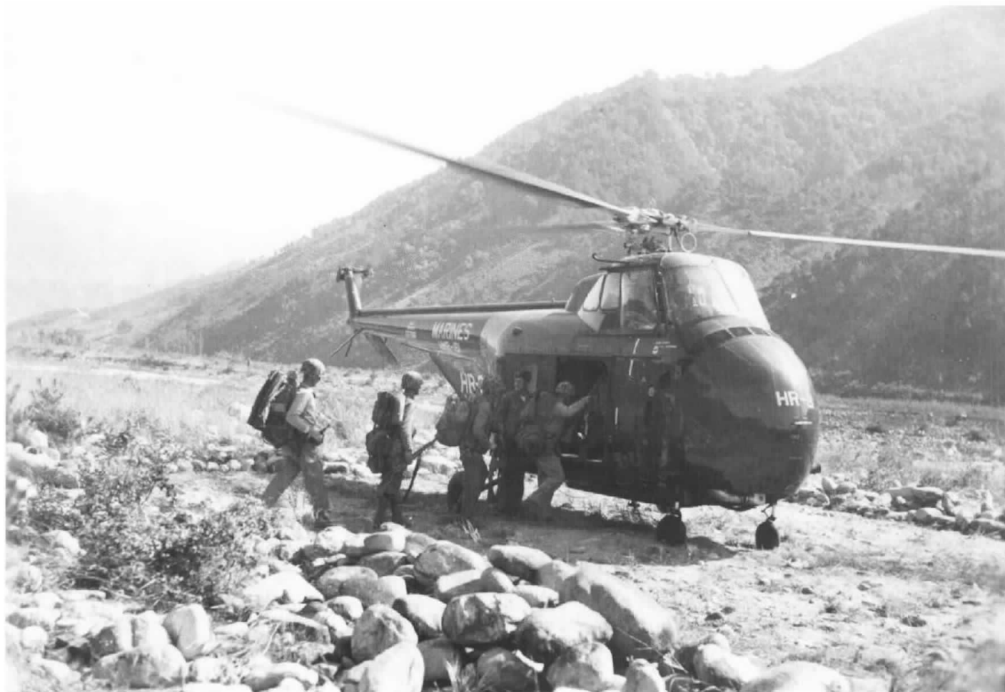
HMR-161 Historical Diary Photo Supplement, Nov-Dec51

Troops load on board an HRS-1 at Airfield X-77 during Operation Bumblebee in October 1951. The Bumblebee troop lift was actually made to test contingency plans in case Chinese Communist forces cracked the Minnesota Line.