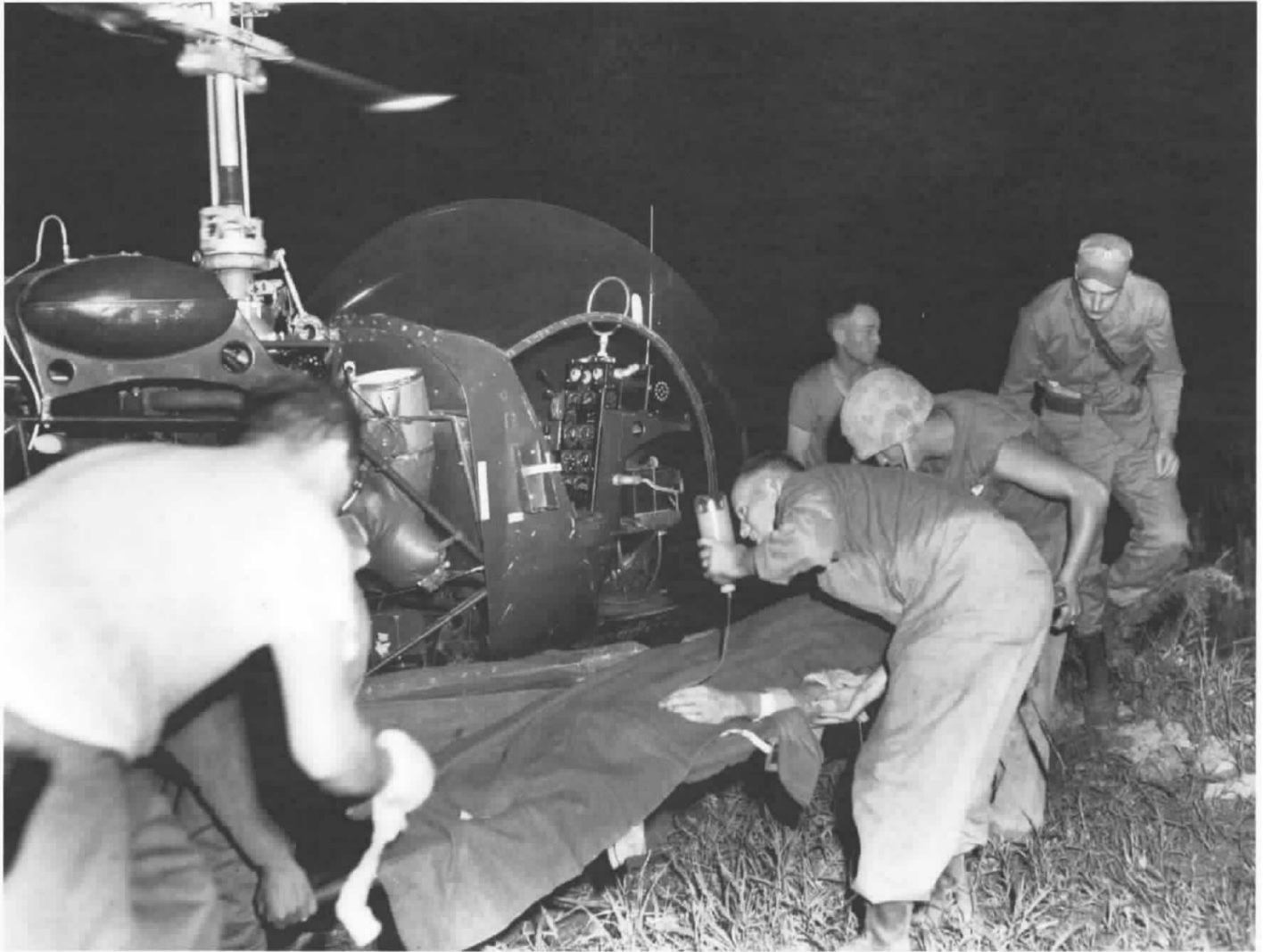
Department of Defense Photo (USMC) A134463

A badly wounded Marine receives life-sustaining plasma and will be flown to an advance medical care facility in the dark. Night evacuations were hazardous affairs because early helicopters lacked instrumentation and back lighting.