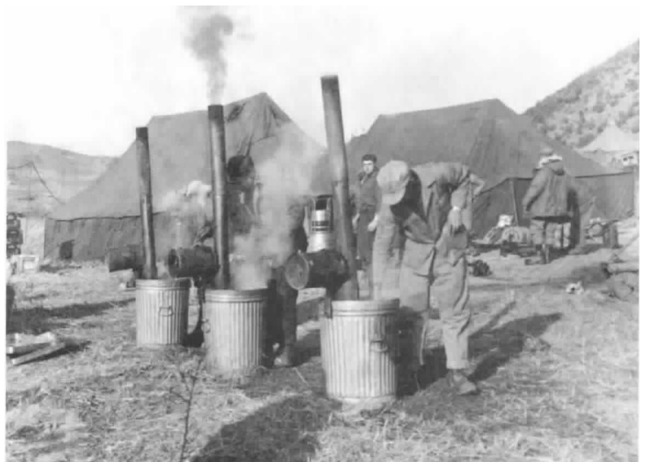
Department of Defense Photo (USMC) A133622

notable such mission occurred in early February when the Eighth Army-Fifth Air Force Joint Operations Center requested help to bring back a fighter pilot and helicopter crew downed in enemy territory. Two previous attempts had been turned away by the time Major Mitchell's HRS-1 departed X-83 for airfield K-50 where it would pick up fighter escorts. Diverted enroute, the helicopter landed on the cruiser Rochester (CA 124) for a pre-flight brief before setting out. Fighter planes strafed the valley and surrounding ridgelines as the helicopter neared the crash site, but no activity was spotted so Mitchell reluctantly aborted the mission. The techniques used on this mission became standard operating procedure even though the rescue attempt had come up empty.