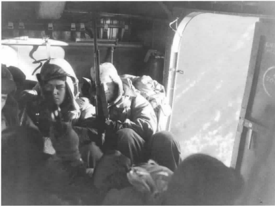
National Archives Photo (USMC) 127-N-A159212

Marines in Korea for the first time are moved into frontline positions the "modern way." Instead of climbing the steep trails, and spending hours to reach the ridges' crest, helicopters airlift troops in a matter of minutes.