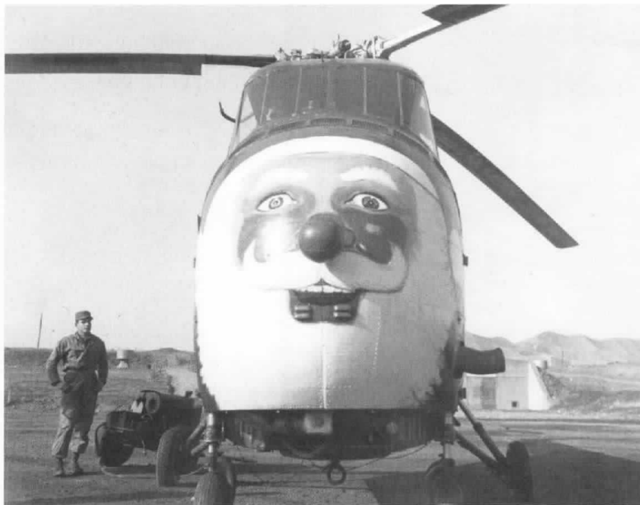
HMR-161 Historical Diary Photo Supplement, Dec52

Beginning in October, one helicopter and a standby crew were assigned to Marine Aircraft Group 12 on a rotating basis to provide air-sea rescue and administrative transportation. As a result of heavy fighting at the Hook the squadron logged the most medical evacuations that month as well, 365. During the month, the squadron