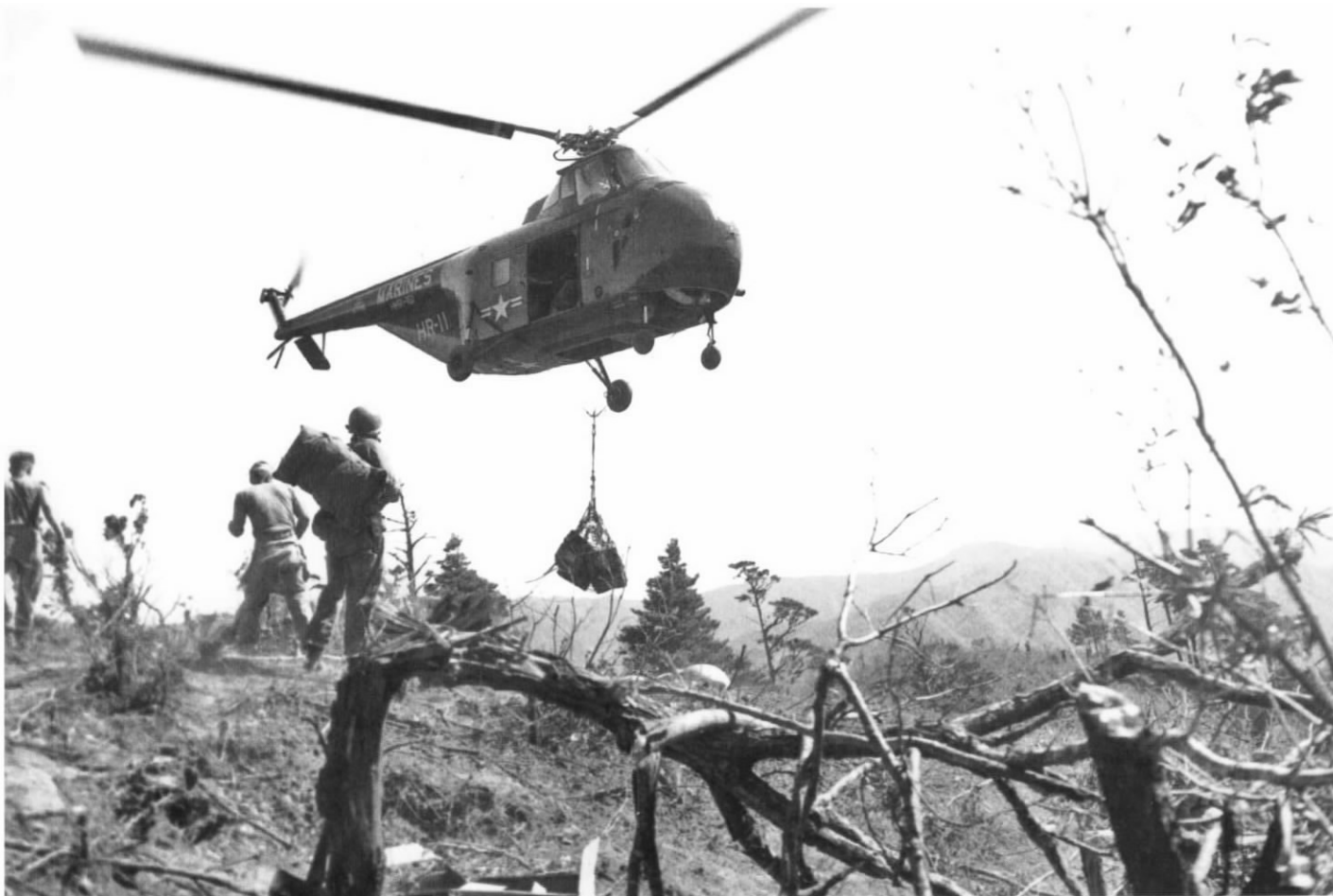
National Archives Photo (USMC) 127-N-A156727

A Sikorsky HRS-1 transport helicopter delivers supplies using "sling loading" techniques. Sling loading employed prepackaged materials that were carried in nets, lifted by a powered winch, and dropped by a remotely controlled hook that allowed helicopters to rapidly deliver vital supplies without landing.