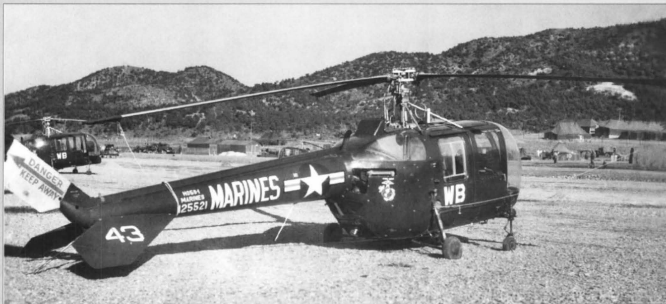
VMO-6 Historical Diary Photo Supplement, Nov52

ed a relief from the rigors of combat, it was not exactly a time of rest and relaxation. The division staff ordered HMR-161 to get busy on the first Marine landing exercise of the New Year (MarLEx I-53). On 13 May, after careful planning and