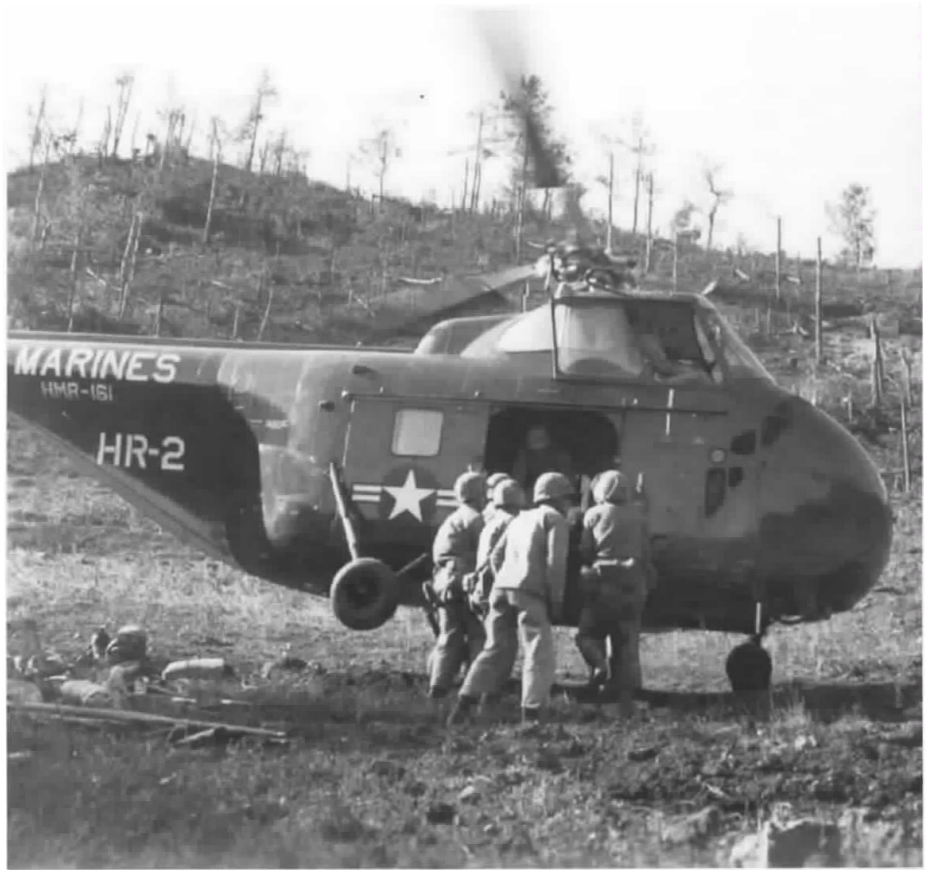
HMR-161 Historical Diary Photo Supplement, Nov-Dec51