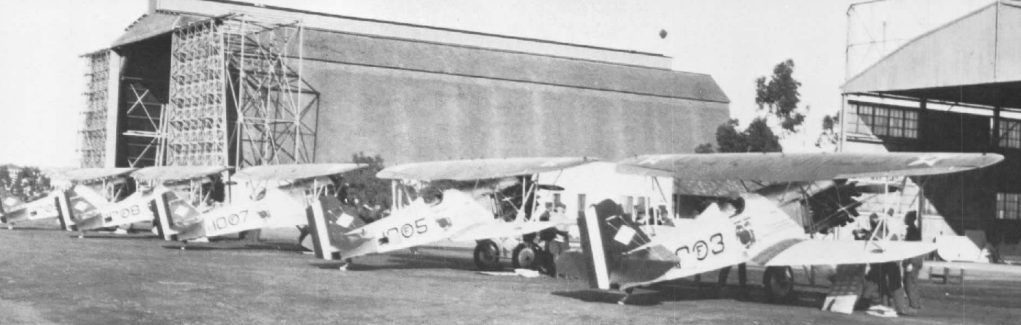
F6C-4 aircraft of Fighting Plane Squadron 10M (VF-10M) on line at San Diego in 1930. Although the Red Devils are not distinguishable, the diamond-shape fields clearly show on the vertical fins.

significance of 'Red Devils' is not recorded." 6 So the reason for adoption of this particular motif remains a mystery. Although the squadron's designation changed several times in the years to follow, the insignia had survived in its original form throughout the unit's history. 7