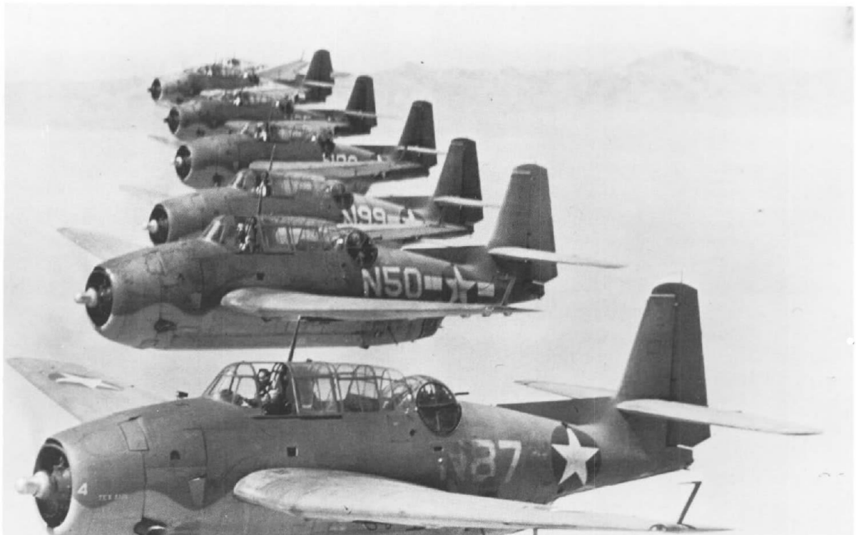
Ewa airfield, Hawaii 1942. When the Japanese attacked Pearl Harbor on 7 December 1941, most of the Red Devil's aircraft were destroyed while still on the ground.