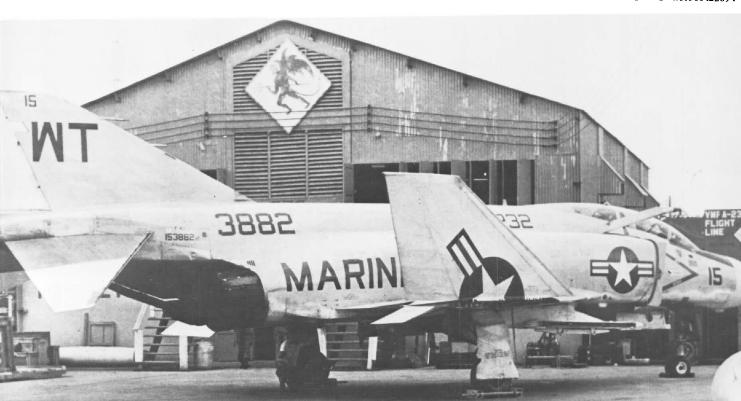
An F-4J belonging to VMFA-232 on the Nam Phong flight line. Nam Phong was better known to the Marines as the "Rose Garden." USMC Photo A422894

USMC Photo A 422933 Red Devil F-4J Phantom jets parked on the apron at Nam Phong. VMFA-232 flew combat missions in Vietnam from Nam Phong.