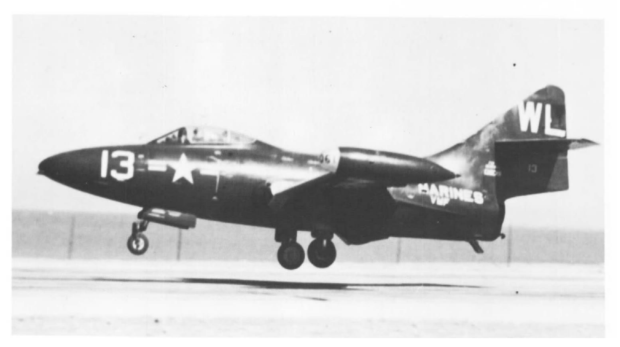
The first jet fighter for VMF-232 was the F9F-2 Panther built by Grumman. It had a Pratt & Whitney engine which produced 5,750 pounds of thrust and enabled the Panther to reach a speed of 650 miles per hour.

ridge about 20 feet from the top. The aircraft was destroyed, but Lieutenant Poe escaped uninjured. 16