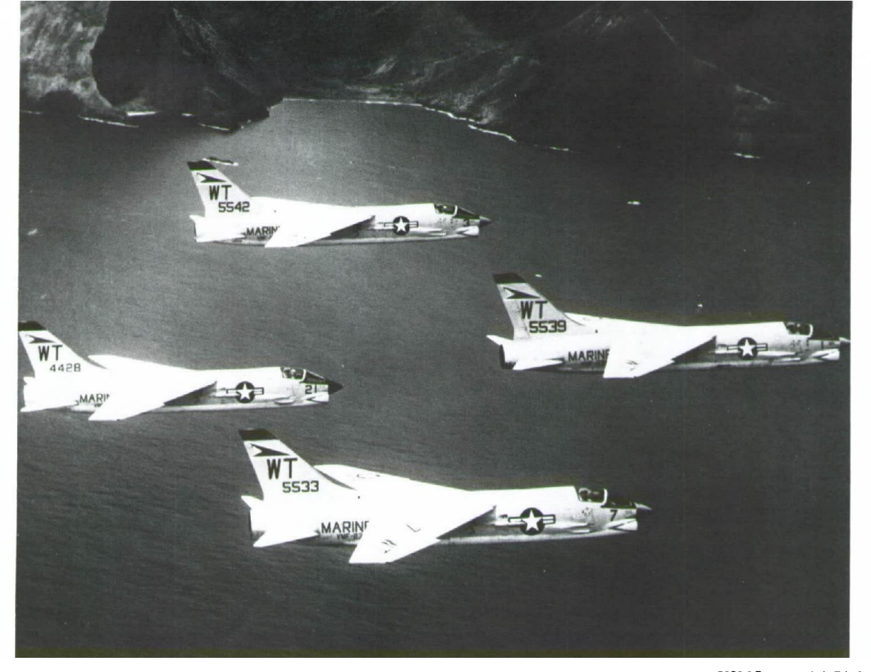
USMC Photo A417492 A flight of four Crusaders from VMF-232. The Chance-Vought Crusader with its 16,000-pound thrust engine with afterburner, more than doubled the thrust of the FJ-4.

terburner of the F-8D far exceeded the performance capabilities of the Fury with its 7,800-pound thrust engine. Although both aircraft were equipped with four 20mm cannons, the Crusader could carry four Sidewinder, heat-seeking, air-to-air missiles while the FJ-4 could only carry two. Additionally, the improved radar and autopilot system of the Crusader enabled it to perform as an all-weather interceptor.<sup>19</sup>