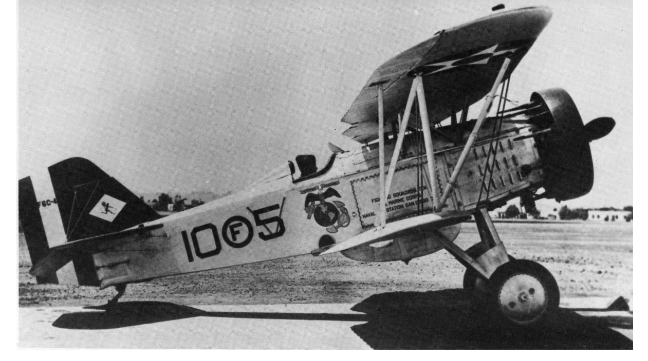
USMC Photo 530812