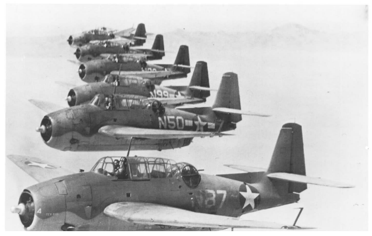
USMC Photo 12734 The Grumman TBF-1 Avenger was a single engine, 3-crew, torpedo bomber monoplane. The Avenger carried a regulation 2000-pound torpedo internally or four 500-pound bombs.