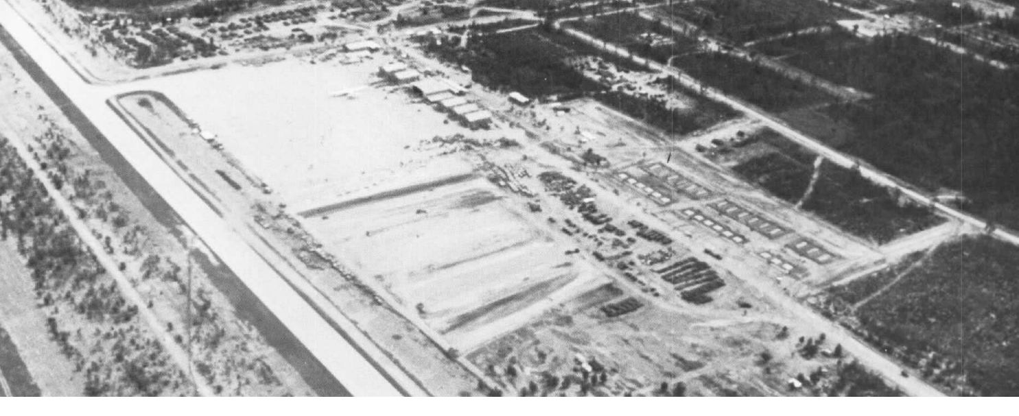
An aerial view of Nam Phong, Thailand looking southwest. Most clearly seen are the aircraft hangar spaces and fuel farm.