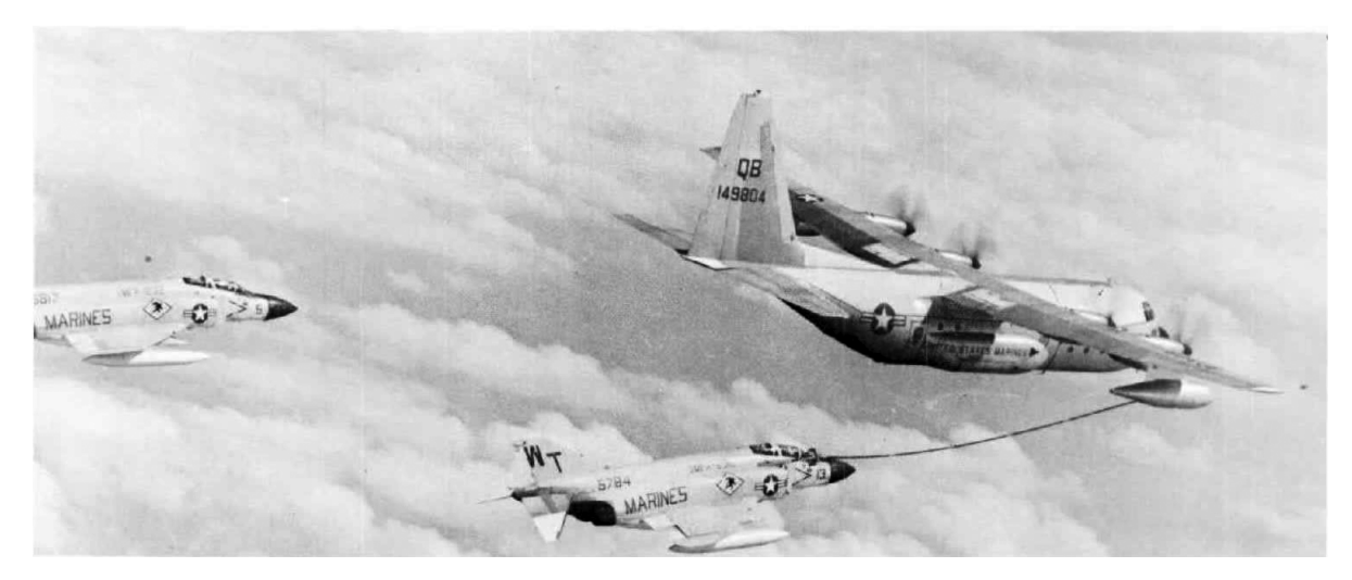
A149802 Air-to-air refueling of a Red Devil F-4B by a KC-130 tanker from VMGR-352. Both squadrons were based at MCAS El Toro, California.

could carry approximately 16,000 pounds of ordnance.<sup>24</sup>