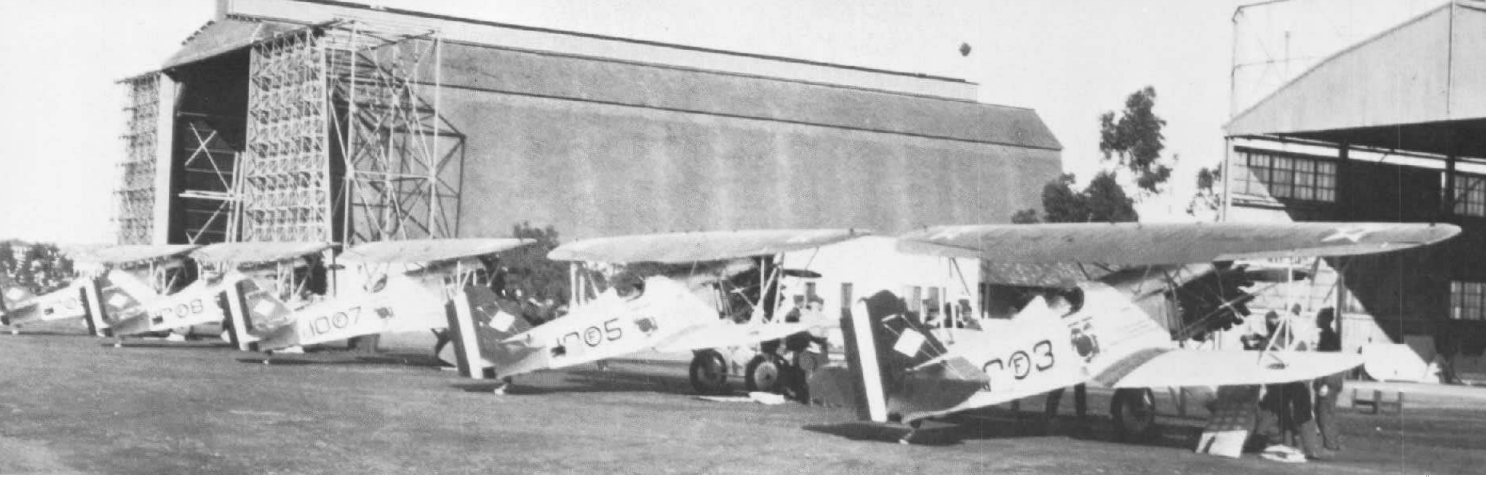
F6C-4 aircraft of Fighting Plane Squadron 10M (VF-10M) on line at San Diego in 1930. Although the Red Devils are not distinguishable, the diamond-shape fields clearly show on the vertical fins.

significance of 'Red Devils' is not recorded.'' So the reason for adoption of this particular motif remains a mystery. Although the squadron's designation changed several times in the years to follow, the insignia had survived in its original form throughout the unit's history.7