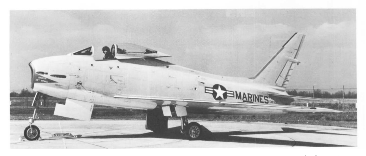
The North American FJ-4 Fury jet was the latest modification of the famed Saber jet used during the Korean War. VMF-232 traded in the F9F-5 Panther jet for the Furies.

20 enlisted men left for Hawaii. The remainder of the squadron departed San Diego on 21 September. Effective 4 January 1954, homeport for VMF-232 was changed from MCAS El Toro to MCAS Kaneohe Bay where the unit was assigned to MAG-13.