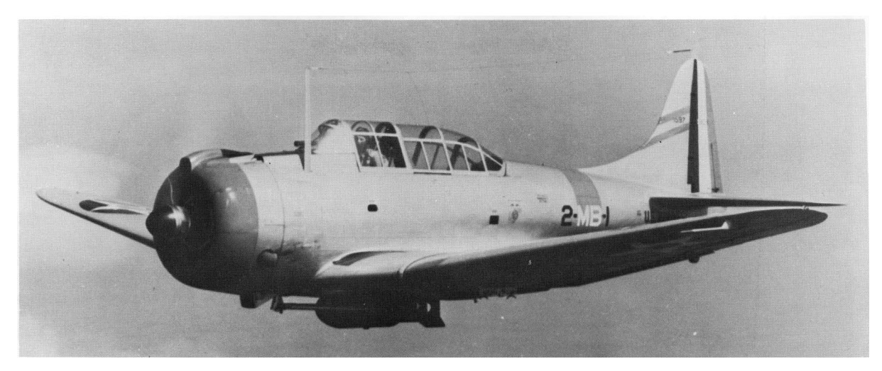
The Douglas SBD-1 Dauntless scout bomber. VMB-2 first received the two-seat monoplane late in 1940.

1940, the squadron turned in its BG-1s and replaced them with the new Douglas SBD-1 Dauntless scout bombers. The two-seat monoplane was equipped with two .50 caliber machineguns in the nose and two .30 caliber guns on a flexible mount in the rear cockpit. For dive bombing, one 1,000-pound bomb could be carried beneath the fuselage, and two 100-pound bombs were mounted under the wings.