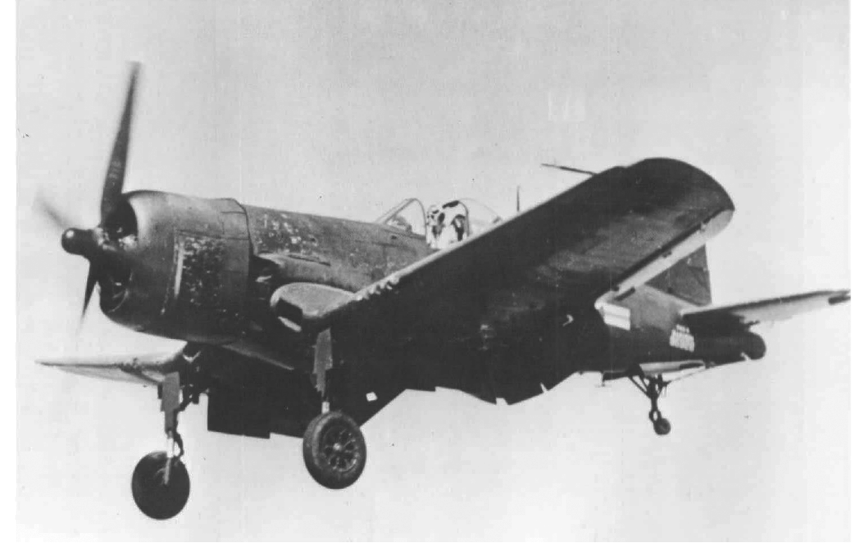
A well-worn F4U-4 Corsair prepares for a landing. VMF-232 received its first Corsair on 14 October 1950.

engine—about 400-horsepower more than the previous models—and was used by several land- and carrier-based squadrons. The F4U-4 had four 20mm cannons (two in each wing) and could be armed with two 1,000-pound bombs or eight 5-inch, air-to-ground rockets. This fighter could reach speeds in excess of 450 miles per hour, climb at 4,800 feet per minute, and had a service ceiling of 41,400 feet.<sup>15</sup>