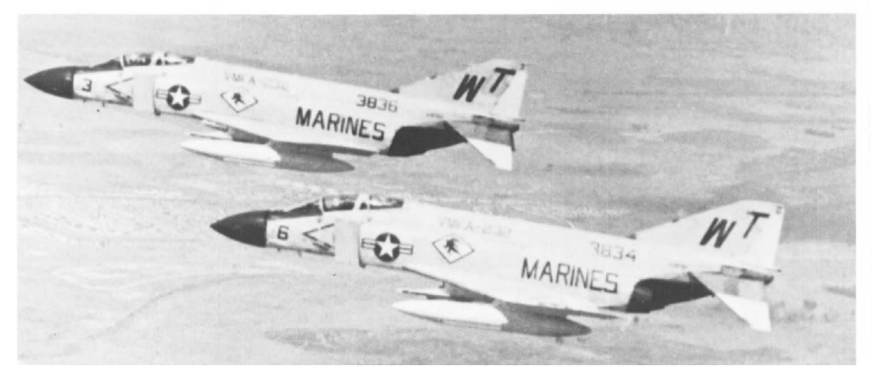
A pair of VMFA-232 Phantoms on a mission over Vietnam. The Red Devils received their first Phantoms on 19 September 1967.

The squadron, flying the newer F-8E Crusader which it received in August 1966, began full combat operations in December. The F-8E was similar to the F-8D but with higher-performance radar which, being mounted in the nose section, changed the appearance slightly. By the end of the month, VMF(AW)-232 had flown 571 sorties while delivering 418 tons of ordnance to enemy targets; four aircraft had received hits, and the Red Devil pilots had become familiar with the I and II Corps area as well as portions of the area north of the Demilitarized Zone (DMZ).