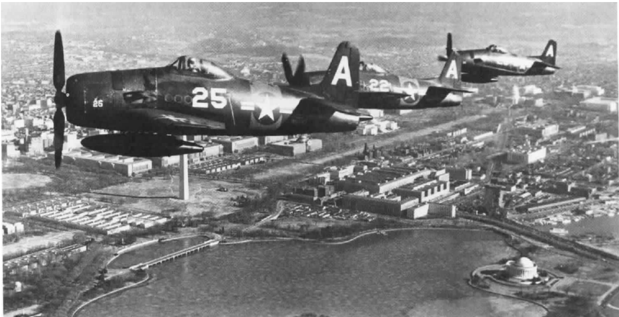
Marine Corps Historical Collection

In 1949, VMF-321 gave up its F4Us for Grumman F6F Hellcats and shortly thereafter, Grumman F8F Bearcats. Considered by many to be the ultimate prop fighter, the powerful little Bearcat could be demanding to fly. Three F8Fs of VMF-321 fly over the Capitol area, the Tidal Basin, and various monuments in 1950. The squadron soon relinquished its Bearcats to the hard-pressed French in Indochina (Vietnam), and went back to F4Us.