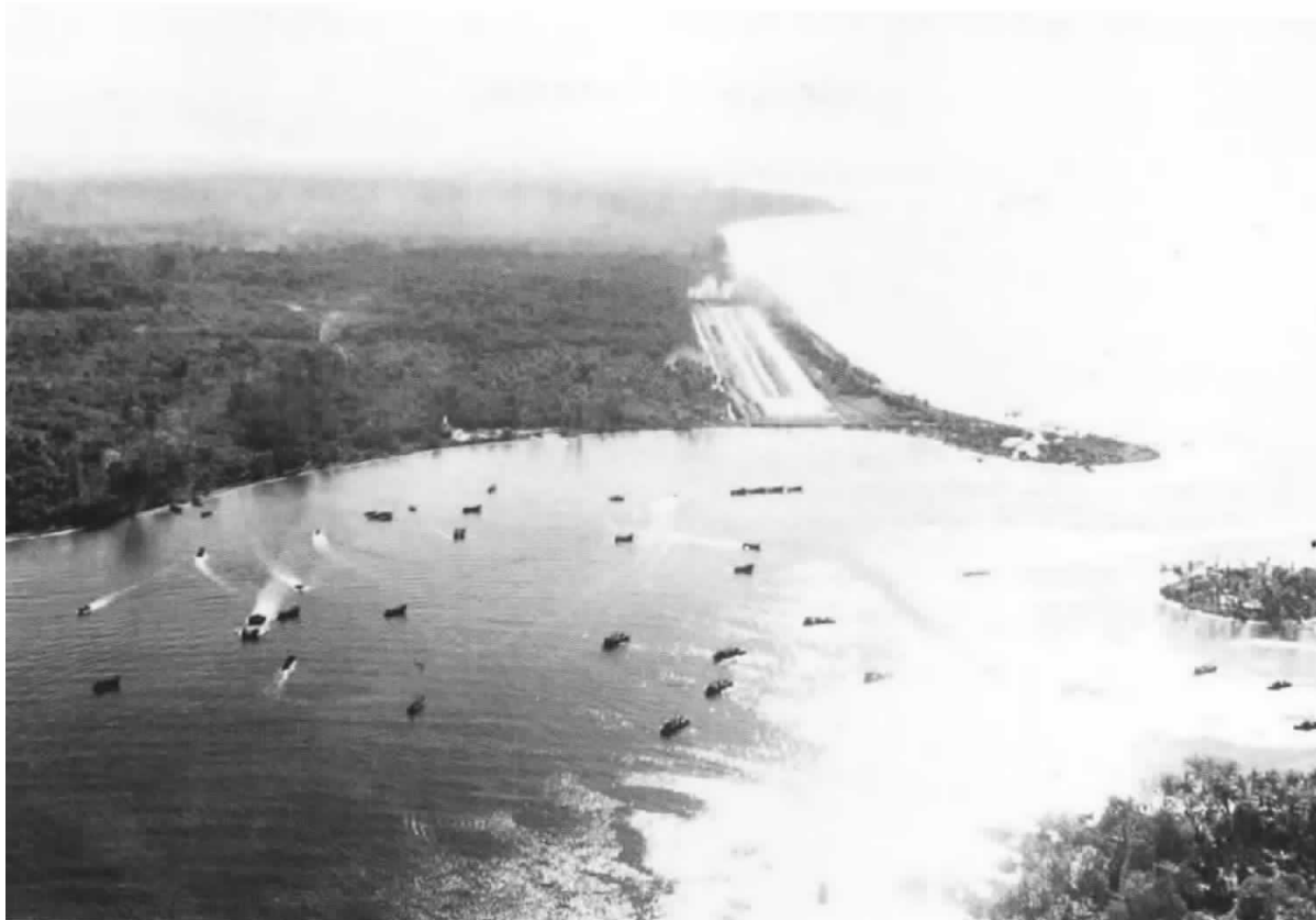
Marine Corps Historical Collection

As were many other American airfields in the Pacific, Torokina Field on Bougainville was literally cut out overnight from the dense jungle which surrounded Empress Augusta Bay.