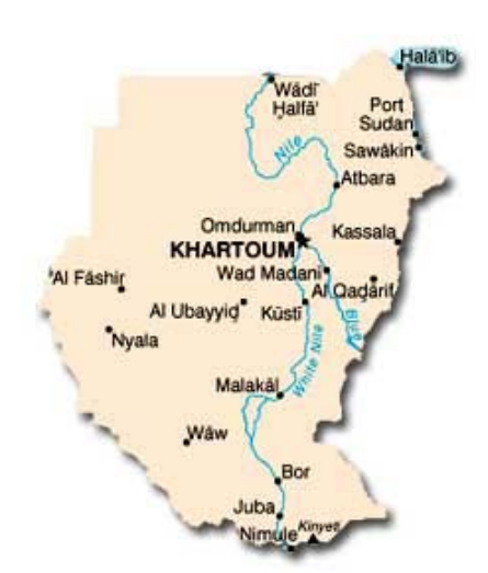
Click to Enlarge Image

Land Boundaries: The length of Sudan's borders is 7,687 kilometers. Border countries are: Central African