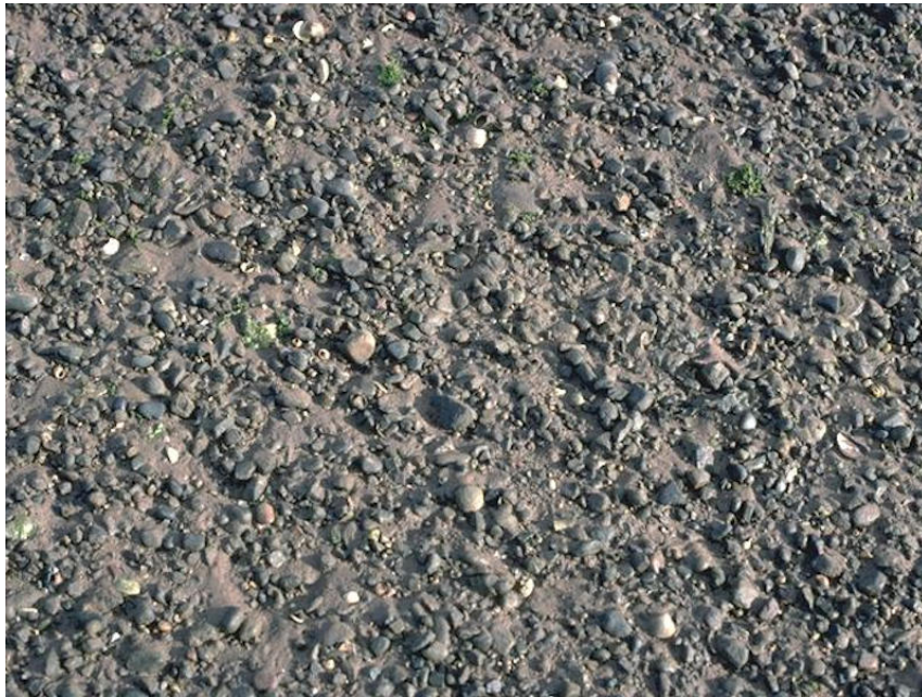
Oligochaetes in variable salinity littoral mobile sand